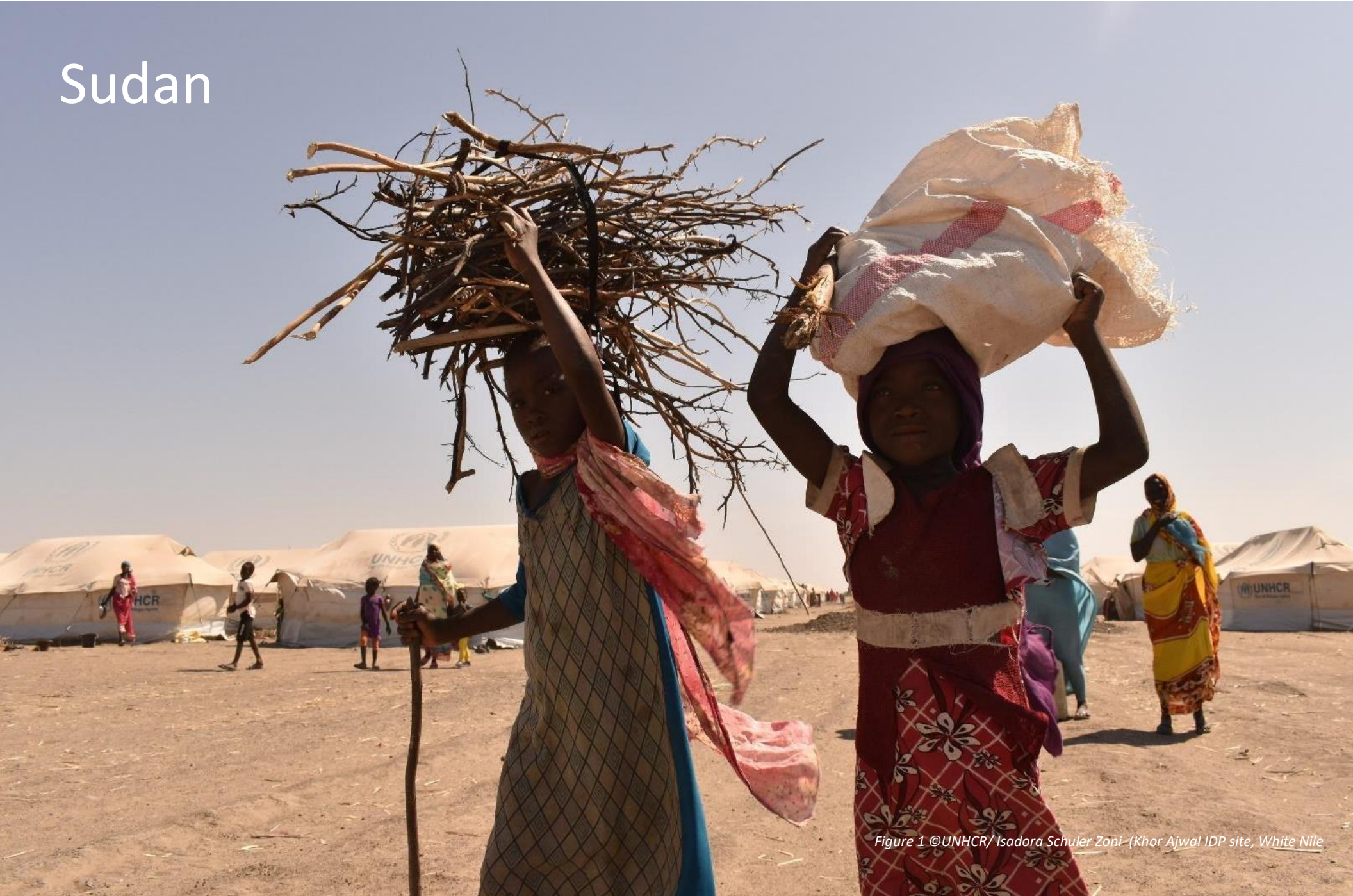
Figure 1 (Khor Ajwal IDP site, White Nile)