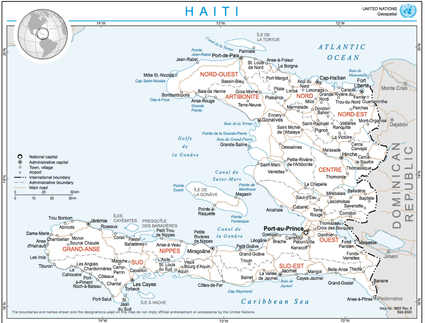
Map: Haiti © UN Geospatial 5