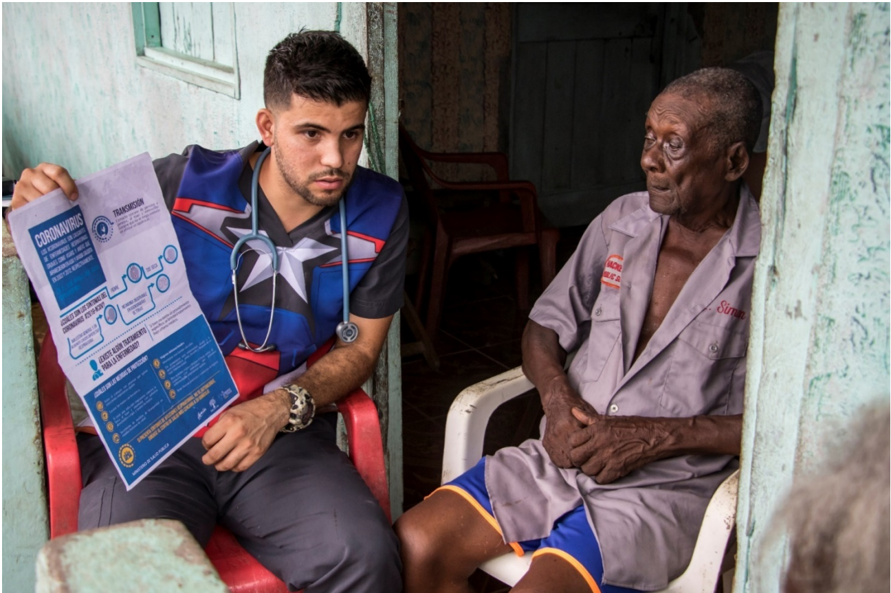
A Venezuelan doctor, himself a refugee, cares for other refugees and locals amid fears about COVID-19 in Ecuador.