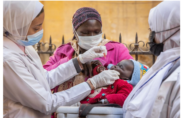
A refugee child receives Polio vaccine as part of the MOHP efforts to vaccinate all children in Egypt.