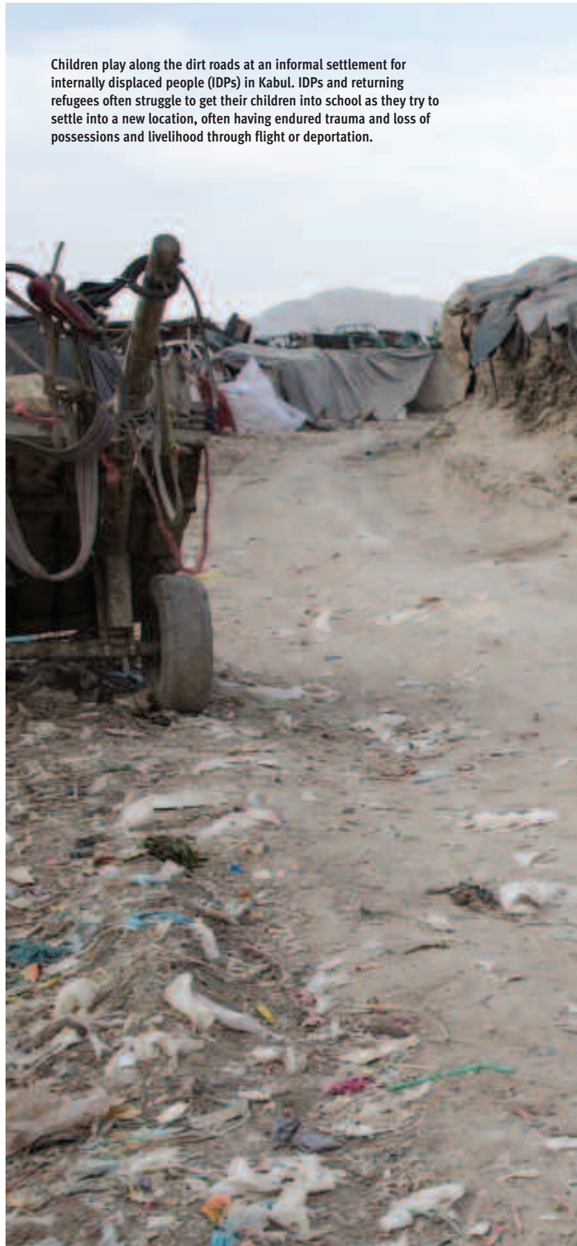
Children play along the dirt roads at an informal settlement for internally displaced people (IDPs) in Kabul. IDPs and returning refugees often struggle to get their children into school as they try to settle into a new location, often having endured trauma and loss of possessions and livelihood through flight or deportation.

There is a shortage of teachers overall, and the difficulty of getting teachers, especially female teachers, to go to rural areas has undermined efforts to expand access to school in rural areas, especially for girls. While the number of teaching positions grew annually in the years preceding 2013, it is now frozen. Seven out of 34 provinces have less than 10 percent female teachers, and in 17 provinces, less than 20 percent of the teachers are women. The shortage of female teachers has direct consequences for many girls who are kept out of school because their families will not accept their daughters being taught by a man. There is particular resistance to older girls being taught by male teachers.