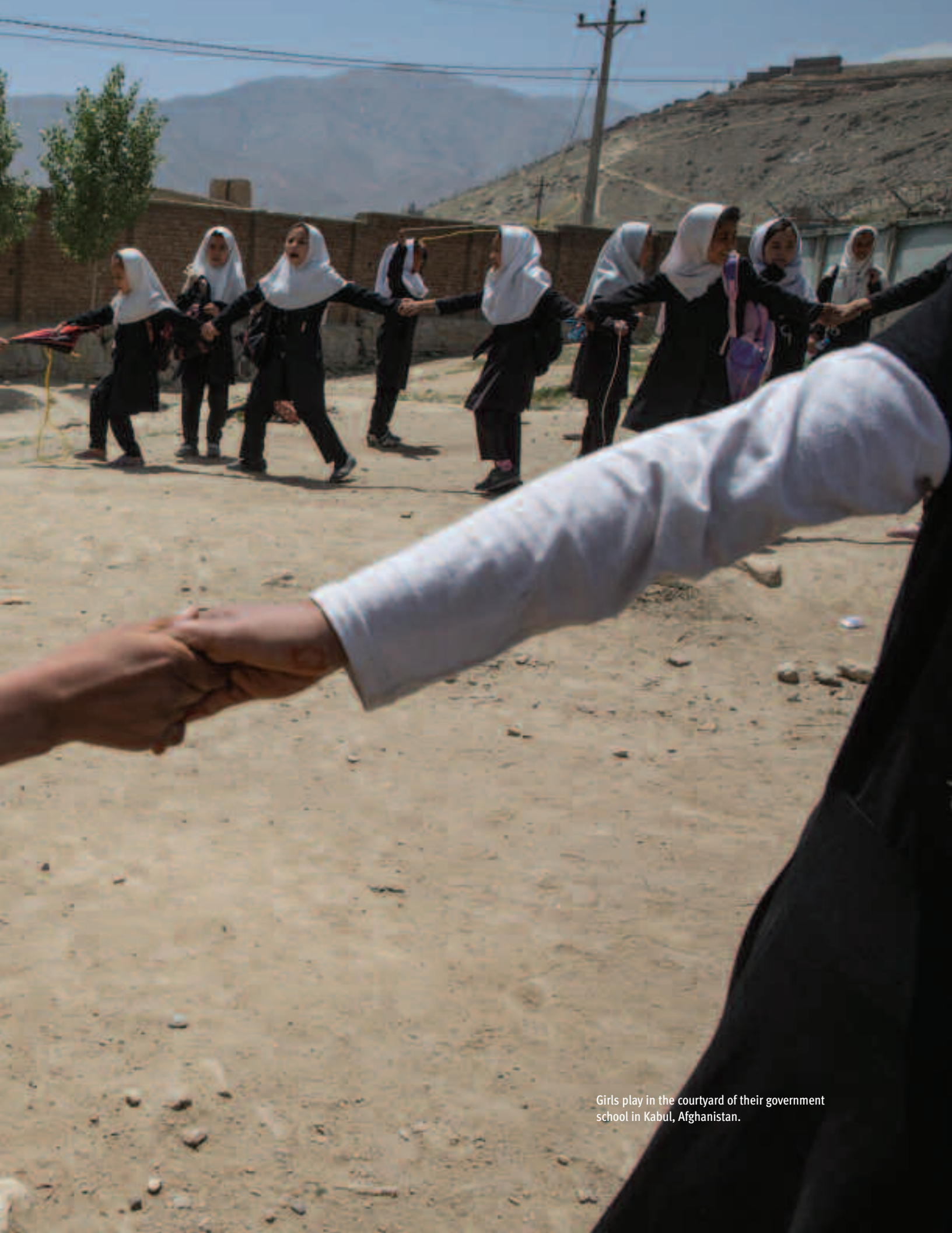
Girls play in the courtyard of their government school in Kabul, Afghanistan.