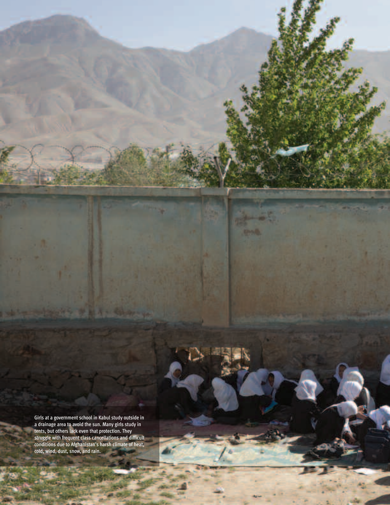
Girls at a government school in Kabul study outside in a drainage area to avoid the sun. Many girls study in tents, but others lack even that protection. They struggle with frequent class cancellations and difficult conditions due to Afghanistan's harsh climate of heat, cold, wind, dust, snow, and rain.