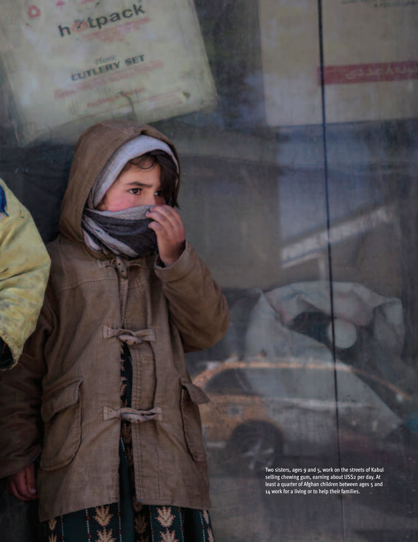
Two sisters, ages 9 and 5, work on the streets of Kabul selling chewing gum, earning about US$2 per day. At least a quarter of Afghan children between ages 5 and 14 work for a living or to help their families.