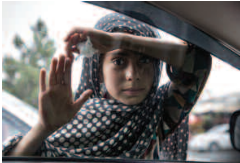
(above) A girl begs on the streets of Kabul, Afghanistan. Girls are most likely to work in carpet weaving or tailoring, but significant numbers also engage in street work, such as begging or selling items on the street.