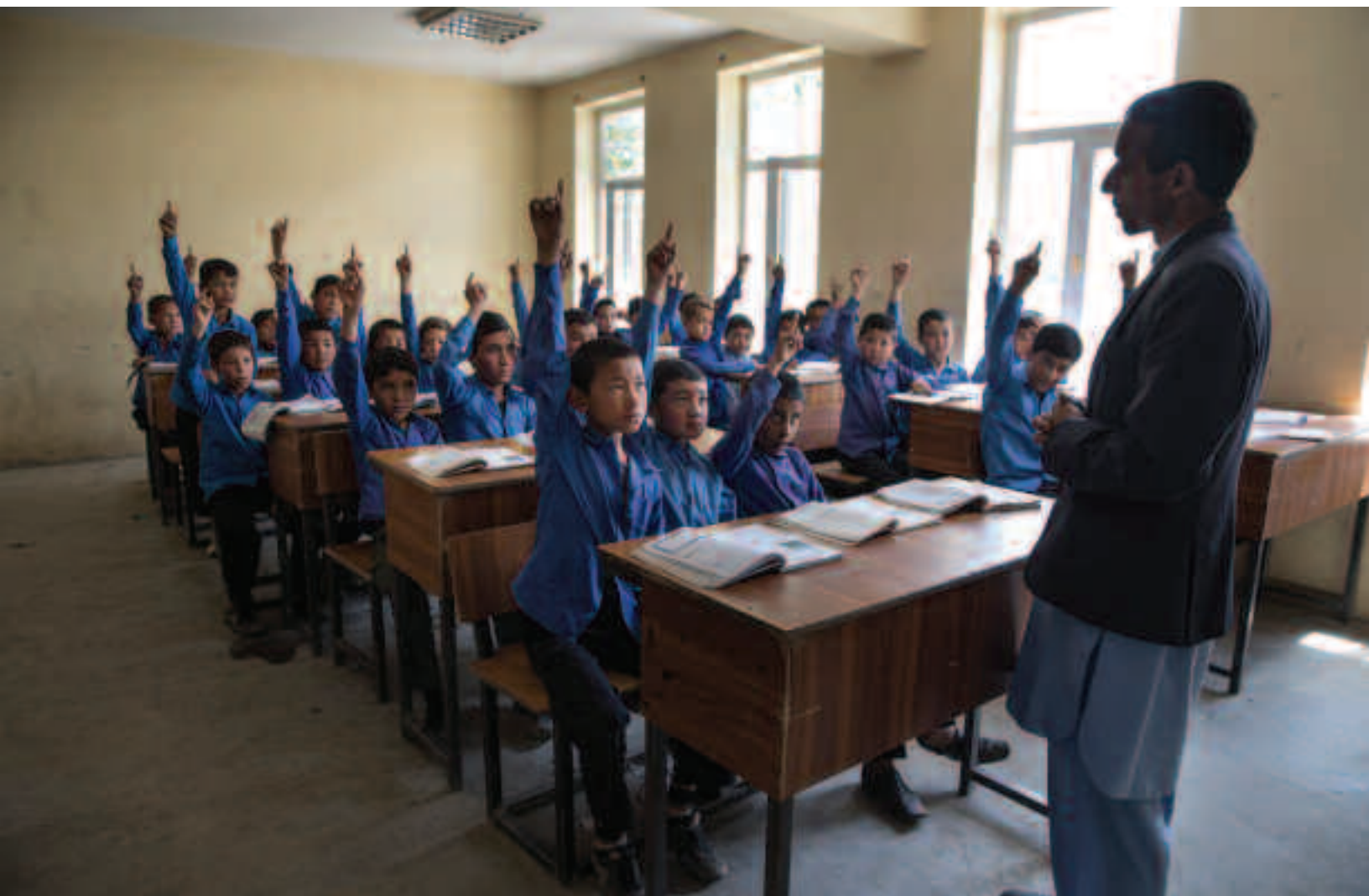
Boys raise their hands during lessons at a government school in Kabul, Afghanistan. Only 37 percent of adolescent girls are literate, compared to 66 percent of adolescent boys. Among adult women, 19 percent are literate compared to 49 percent of adult men.

a model that has been used to successfully reach many Afghan girls who would otherwise be denied education; it remains entirely outside the government education system and is wholly dependent on donor funding. Madrasas, schools devoted primarily to religious instruction, teach many children but often exclude core subjects in the government’s curriculum. Private schools exist as well, providing an option for some families that can afford fees, believe they will offer a higher quality of instruction, or are in a location where there is no government school.