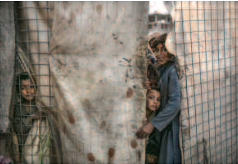
Children peek through a gate at an informal settlement for internally displaced people in Kabul, Afghanistan. The country has well over a million internally displaced people, with displacements ongoing. Displaced families often face insurmountable barriers in obtaining the documentation they need to get their children into school in their new location.

managing menstrual hygiene at school and are likely to stay home during menstruation, leading to gaps in their attendance that undermine academic achievement, and increase the risk of them dropping out of school entirely.