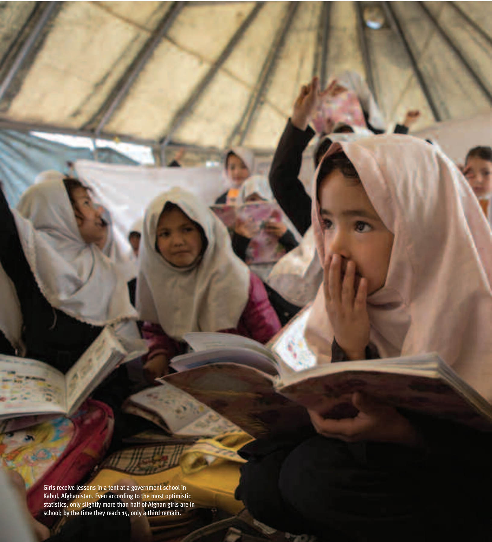
Girls receive lessons in a tent at a government school in Kabul, Afghanistan. Even according to the most optimistic statistics, only slightly more than half of Afghan girls are in school; by the time they reach 15, only a third remain.