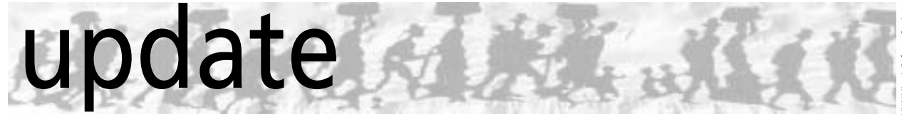
UNHCR/Isaiah Refugee Service