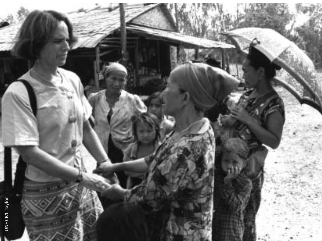
UNHCR protection officer with returnee women in Laos.