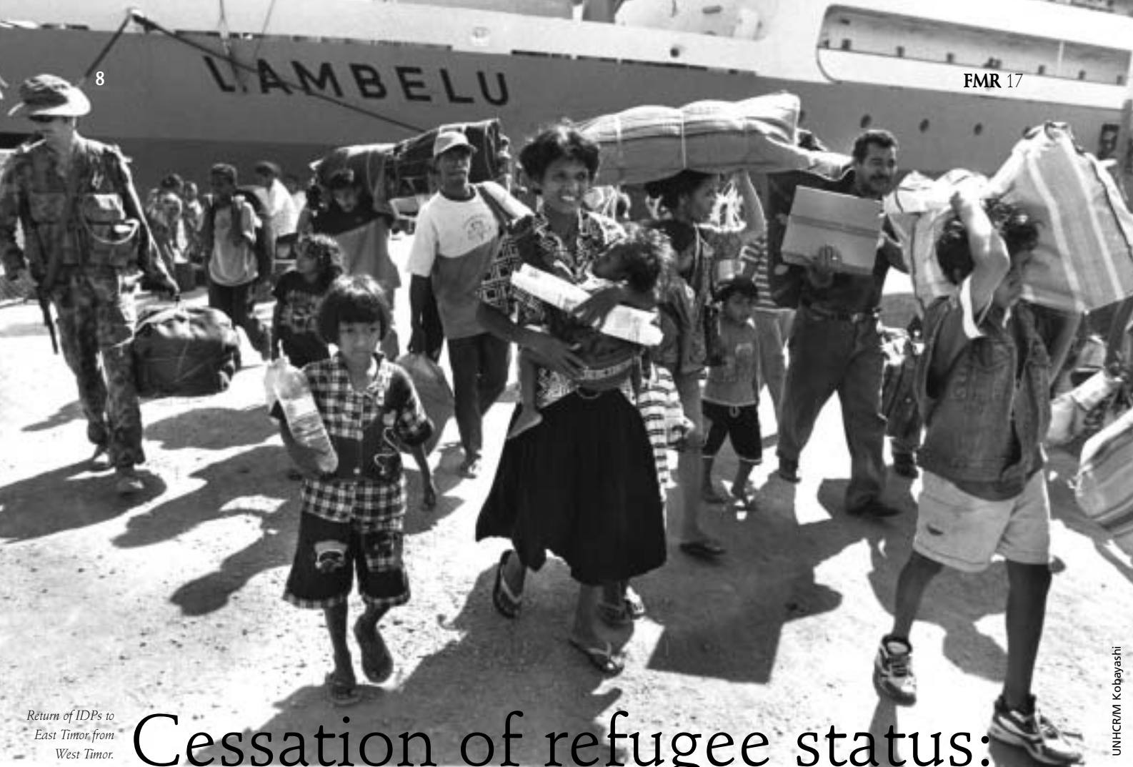
Return of IDPs to East Timor, from West Timor.