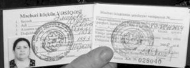
IDP in Baku, Azerbaijan