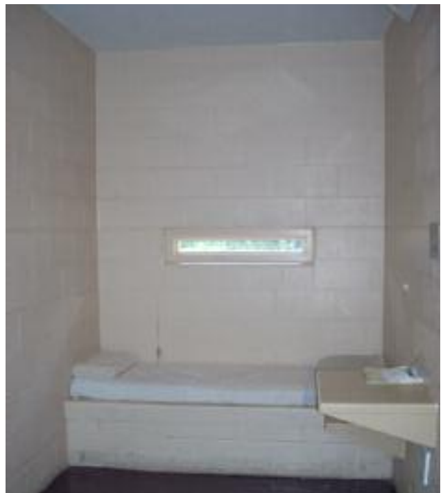
A bedroom at the Southwest Indiana Regional Youth Village (Vincennes), Indiana, is reminiscent of a prison cell.

The problem of institutional facilities and their impact on safety and care is particularly pronounced in staff-secure and secure facilities. (See Appendix F for definition of secure and staff-secure facilities.) In the year we conducted most of our field research, 108 DUCS opened new secure and staff-secure facilities. In part this was a response to the growing number of children referred to DHS from law enforcement. 109 However, DUCS increasingly places children with behavioral and mental health problems in staff-secure and secure facilities, rather than therapeutic programs. Many of these facilities do not yet have adequate staffing in place to handle the increased population, prompting concerns from staff and attorneys about the facilities' ability to meet the complex needs of the children. 110 At the time of our visit to the Northern Virginia Juvenile Detention Home (NOVA) in Alexandria, Virginia, the facility had no daily staff members on site who were trained in DUCS policies and procedures. 111 Rapid population growth seems to have contributed to abuses that developed at both the Away From Home Texas