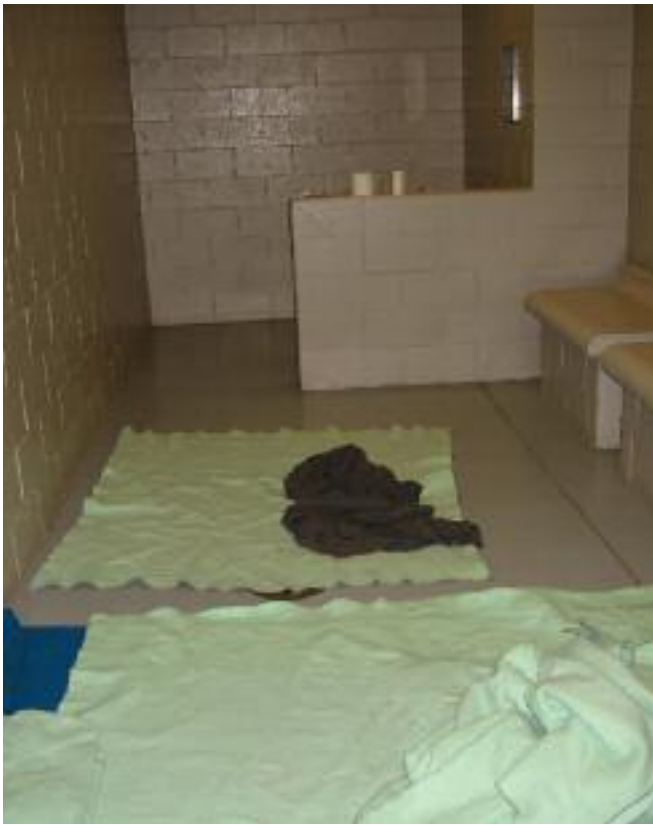
Children held at the Fort Brown Border Patrol facility sleep on cold floors, with minimal bedding.

There are no appropriate sleeping accommodations for children in Border Patrol stations. Like adults, children sleep on cold floors, thin mats, plastic sheets, cement benches, newspaper or plastic “boat beds.” At El Paso and Ft. Brown, most children are provided with blankets, but at the Harlingen substation children received no blankets at all. When we asked why they had none, agents told us that the station used to provide them, but that the blankets became infested with bugs because the children were so dirty. The blankets were discarded. 64 Children at stations where blankets are provided confirmed that the blankets were dirty; one child stated that she did not use the blanket she was given because it had bugs on it. 65