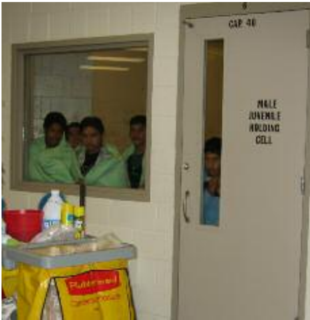
Boys held in a cell at the Border Patrol's Fort Brown (Texas) station.

inal backgrounds that would justify ICE's retention of custody over these children. 45 Custody of unaccompanied children with criminal convictions was further clarified by the TVPRA, which provides that unaccompanied children charged with having committed a criminal offense should be in DUCS custody, and may be placed in a secure DUCS facility.