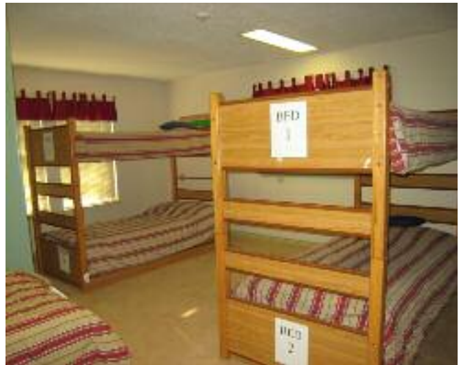
A bedroom at the Baptist Child and Family Services (BCFS) shelter, an ORR facility, in San Antonio, Texas, has a more dorm-like feel.

DUCS uses a range of facilities from foster care, to group homes, shelters, staff-secure and secure facilities for the placement of children. (See Appendix F for additional information.) While DUCS has expanded the use of foster care and decreased the use of secure facilities (discontinuing agreements with 31 secure facilities used by the former INS), 133 a lack of clarity and consistency in placement decisions has sometimes resulted in an overuse of staff-secure and secure facilities. Some staff-secure and, particularly, secure facilities are, or closely resemble, juvenile correctional facilities, and are characterized by constant observation from staff and increased structural security. Staff-secure and secure facilities are wholly inappropriate for most 134 unaccompanied children because they are based on a correctional, not a child-welfare, service model and feature a high degree of institutionalization. However