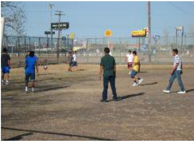
Boys play at the Baptist Child and Family Services (BCFS) shelter in San Antonio, Texas.

care settings is dependent on the level of engagement and resources available to individual families.