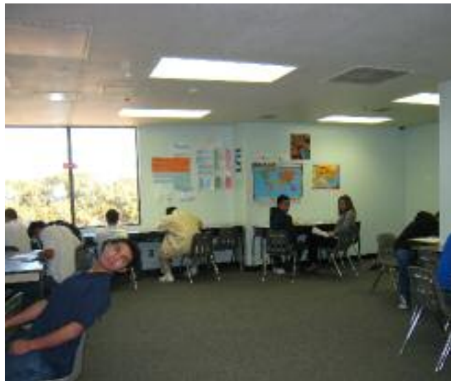
The quality—and quantity—of education varies between DUCS program sites. Here, children study at the Abraxas Hector Garza Center in San Antonio, Texas.

training or vocational training. Many of the children expressed a desire for more English language instruction. In addition, most facilities lacked age-appropriate books or magazines for children in their native languages.