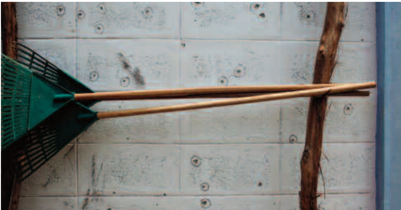
(above) Bullet holes on the inside of the wall of Ban Paka Cinoa Elementary School in Pattani. Paramilitary Rangers based in the school compound came under heavy attack by insurgents using gunfire, improvised explosive devices, and grenades in 2010.

The loss of school buildings disrupts children's access to a quality education, saps scarce school resources, and generates fear among teachers, children, and their parents. Students displaced from their classrooms often meet in crowded tents or other prefabricated units in the school playground. Teachers and students told Human Rights Watch that these temporary teaching conditions cause problems for the children, as they can be crowded and noisy, and in certain weather conditions, overly hot or wet. The impact is often felt beyond the targeted school, as neighboring schools are often temporarily shut down following an attack.