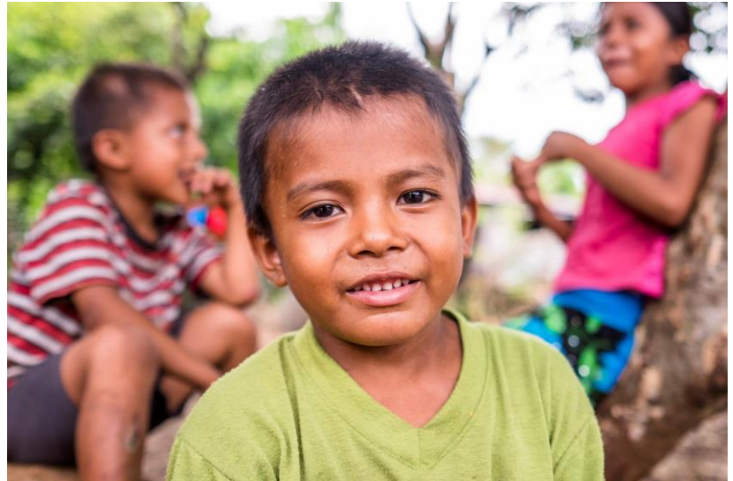
Guatemala. Mexican border town popular with refugees