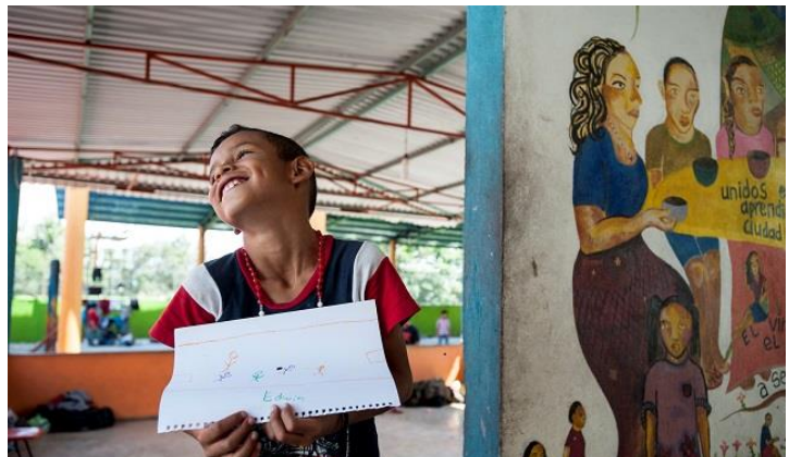
Mexico. Families find safety in UNHCR funded shelters.