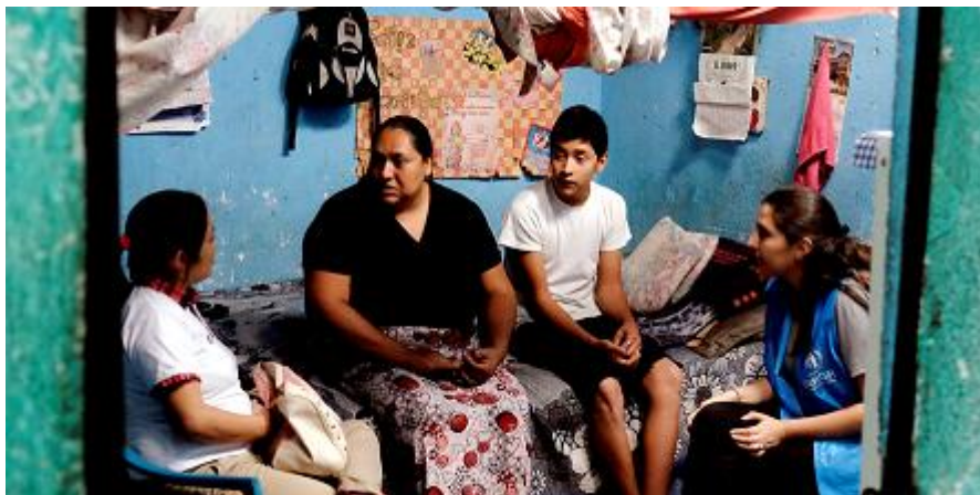
Guatemala. UNHCR along The Migrant House work on the project Children of Peace.