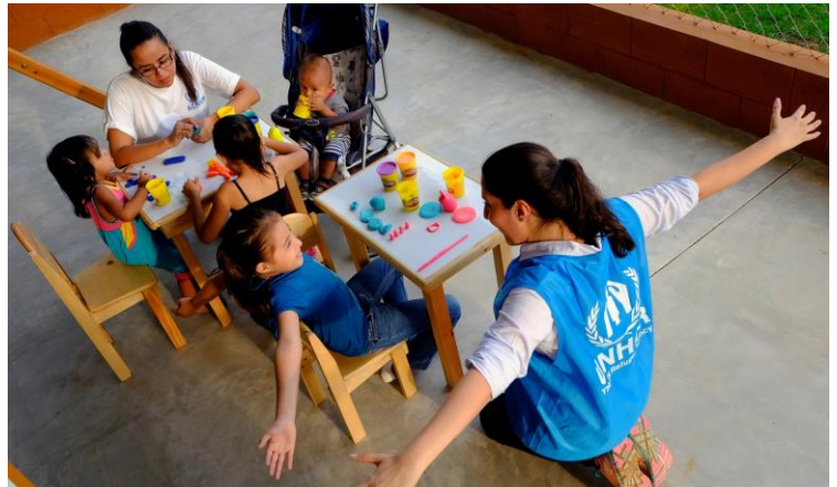
Families find safety in UNHCR funded shelters.

position favorable to ATD, with the coordinated effort of migration officials, the Commission for Refugee Aid (COMAR) and civil society shelters supported by UNHCR. According to the COMAR, Mexico received a total of 8,781 asylum applications 2016, of which 91.6 percent were from the NTCA. In total, 3,056 were recognized as refugees or received complementary protection, an increase of 175 percent when compared with the total number of asylum applications during 2015, and the highest number of asylum applications recorded since the 1980s, with a recognition rate of 63 percent. Based on the average monthly increase of over 8% in asylum applications since January 2015 and changes in migration trends, UNHCR projects that the total number of asylum applications in 2017 could be over 21,000. Throughout 2016, 4,693 persons of concern were housed in 14 shelters supported by UNHCR in the States of Tabasco, Chiapas and Mexico City and a total of 4,552 asylum-seekers and refugees received humanitarian assistance outside of shelters.