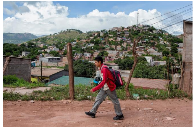
A student walks home from school in the community of La Era in Tegucigalpa, Honduras.