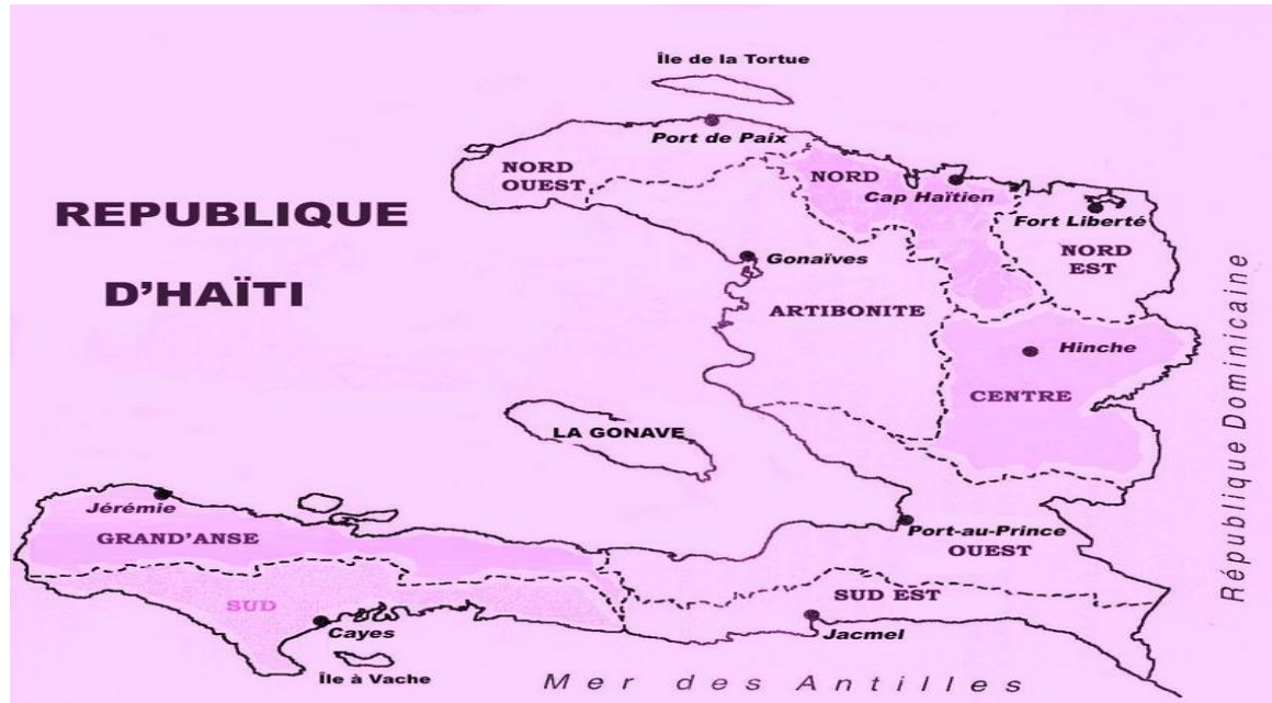
Map of the Republic of Haiti