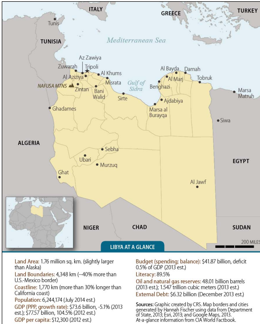
Figure 2. Libya: Map and Select Country Data

Inaction may have considerable negative consequences, as unchecked threats could become more costly and risky to address over time. If current conditions persist or deteriorate further, the country may continue to fragment as locally organized groups and other non-state actors seek to protect their interests and gain advantage over rivals. Under such circumstances, groups active in Libya that are hostile to U.S. interests may grow stronger. On the other hand, direct efforts by the