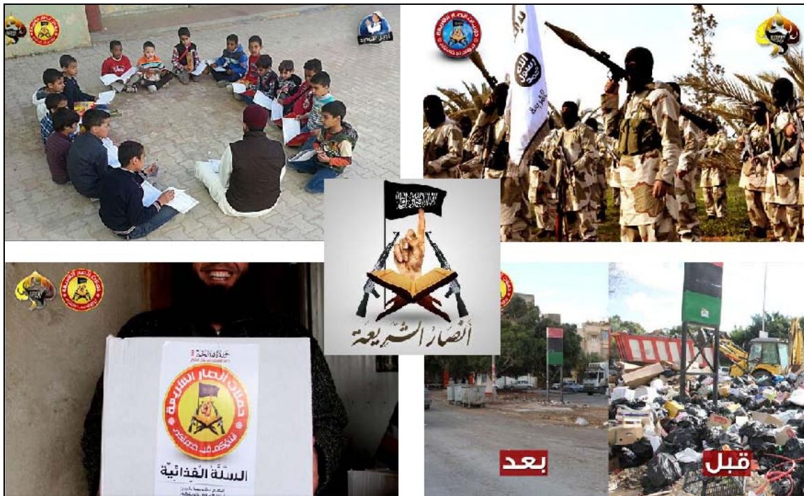
Figure 3. Recent Ansar al Sharia Imagery from Libya and Syria