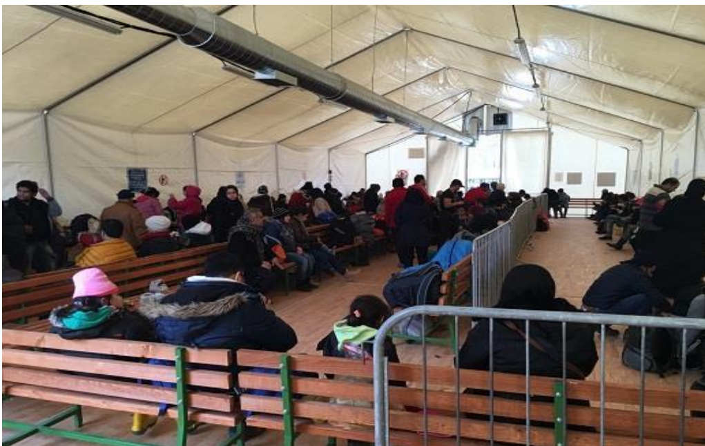
Asylum seekers waiting for registration inside the fully winterized rub hall, Preševo (Serbia) ©UNHCR January 2016.

In Italy , no transfers took place under the EU relocation scheme. On 11 January, 35 persons, from Somalia, were detected in the Province of Lecce, in Apulia. The dead body of a Somali woman was also retrieved on the shore, whilst around 8 persons are still reported missing at sea. The group recounted to have left from Greece and to have been beaten by the smugglers and kicked out of the dinghy.