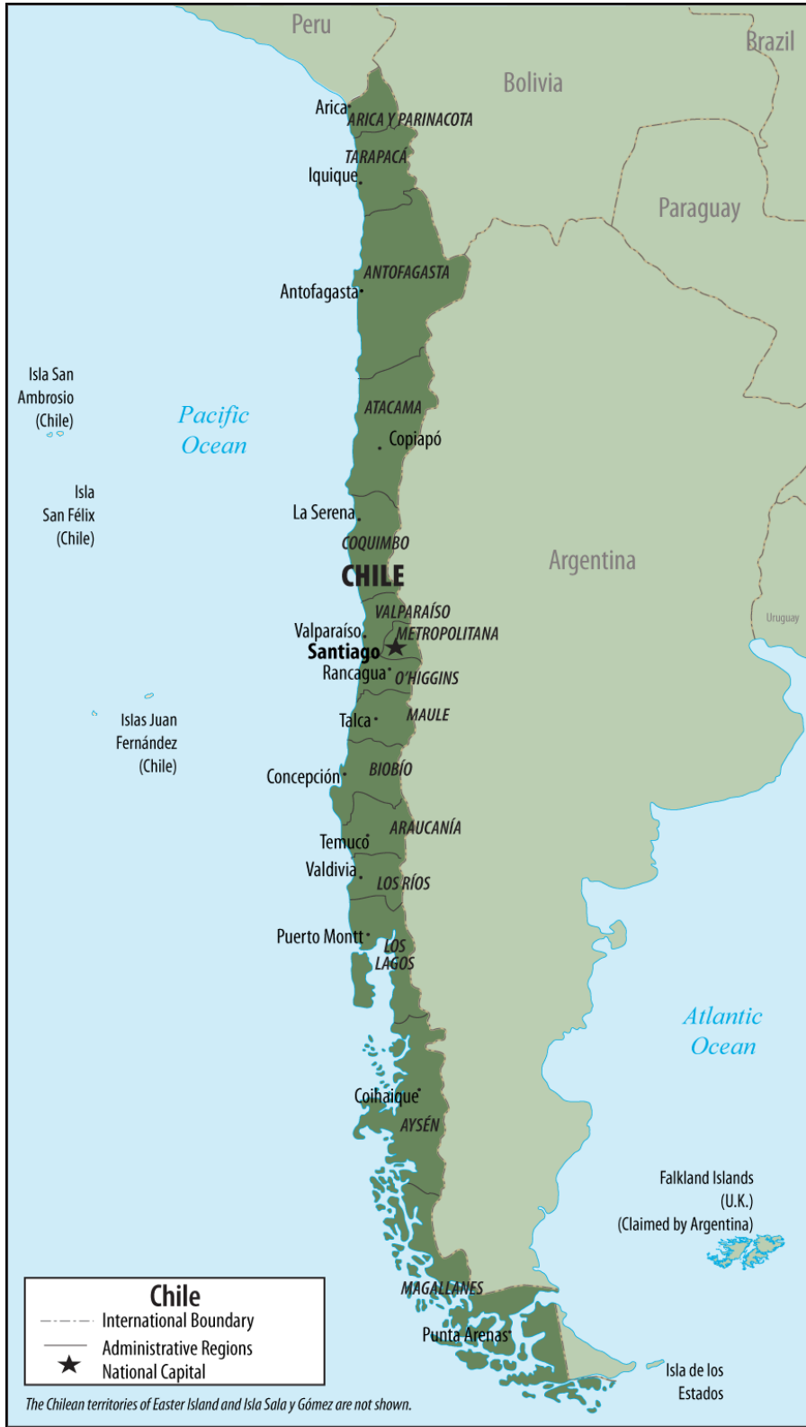
Figure 1. Map of Chile