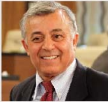
Figure I. Select Libyan and U.S. Figures