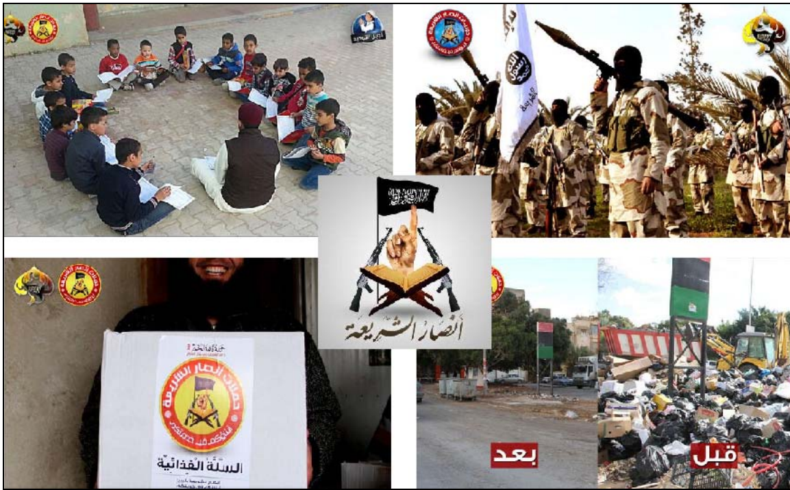
Figure 3. Recent Ansar al Sharia Imagery from Libya and Syria