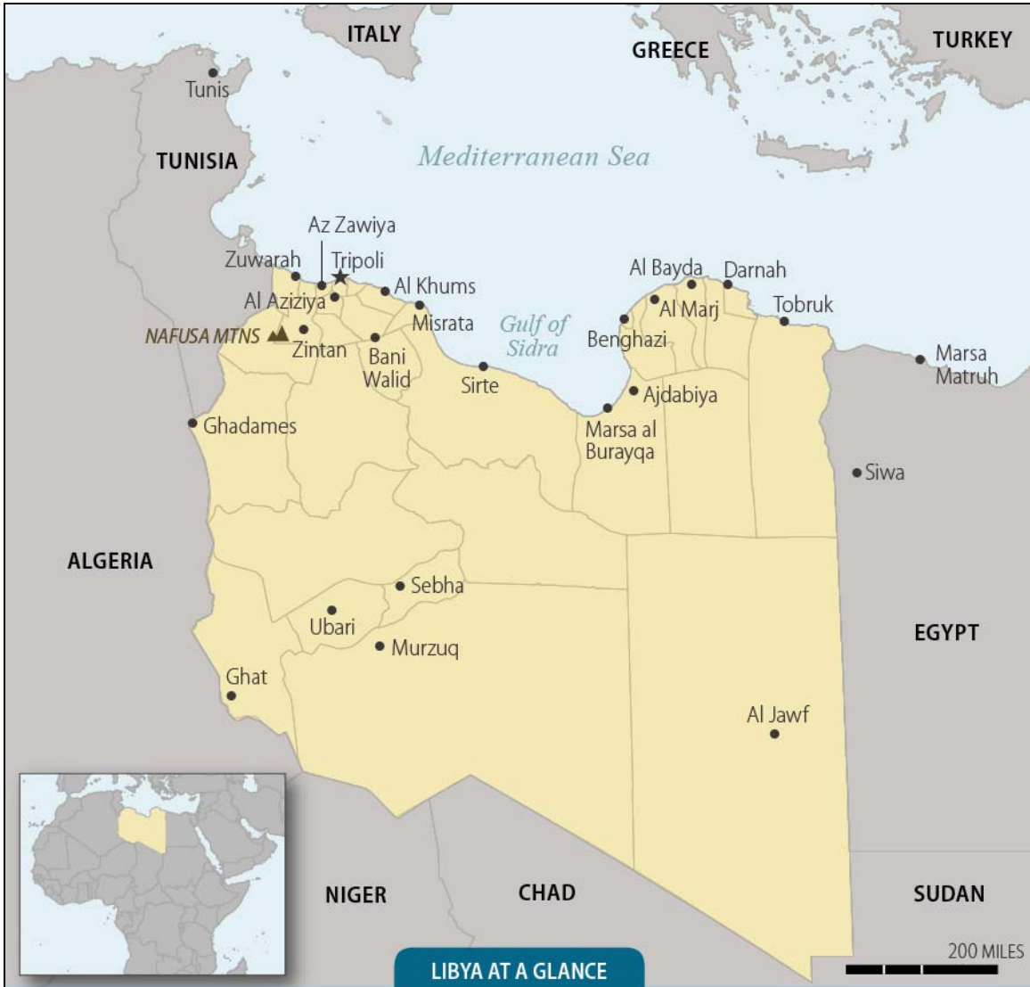
Figure 2. Libya: Map and Select Country Data