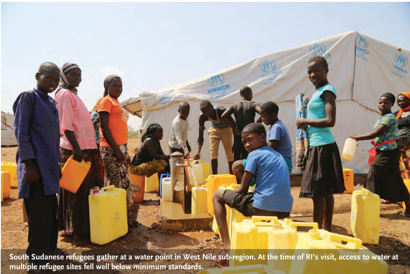
South Sudanese refugees gather at a water point in West Nile sub-region. At the time of RI's visit, access to water at multiple refugee sites fell well below minimum standards.

Sudanese refugees in Uganda received just 40 percent of the resources required. 13 The effects of this shortfall are plain to see: the World Food Program has halved rations for most refugees who arrived prior to mid-2015. And as the number of refugees increases, further cuts for additional populations are inevitable without substantial new funding – a move that is certain to increase the vulnerability of women and children, who make up the vast majority of the refugee population. While many refugees do have access to agricultural land, humanitarians told RI there is a clear need for additional food assistance – particularly for South Sudanese refugees. One food security official told RI that areas hosting South Sudanese refugees “are, climatically, and in terms of the refugees’ skills, less productive for agriculture than, for example, the Congolese refugee areas” in the west of the country. Further, RI was told that many South Sudanese refugees arrived in Uganda or received access to land too late for the main planting season (which runs from August to October), leaving them almost entirely reliant on food