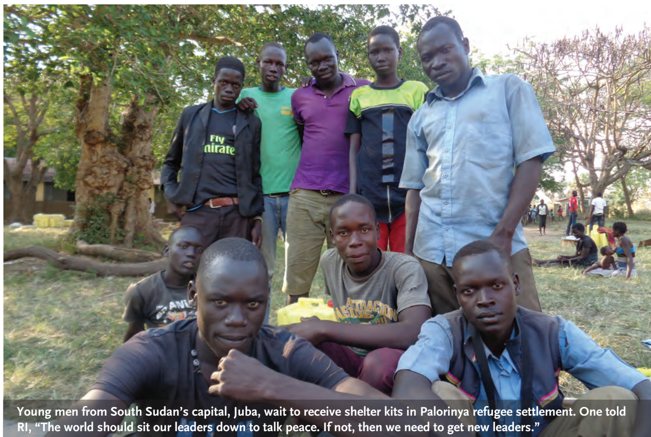
Young men from South Sudan's capital, Juba, wait to receive shelter kits in Palorinya refugee settlement. One told RI, "The world should sit our leaders down to talk peace. If not, then we need to get new leaders."

According to multiple senior humanitarians with whom the RI team spoke, OPM exercises tight control over where NGOs can intervene and in which sectors they can work. NGOs are obliged to obtain permission from OPM in order to operate in refugee settlements. Further, OPM is a signatory to all partnership agreements between NGOs and UN agencies. Such measures are not unusual in refugee situations; however, humanitarians told RI that OPM personnel had used these measures as a means to interfere in decisions about partnerships and contracting. RI was told of multiple cases in which OPM personnel had requested