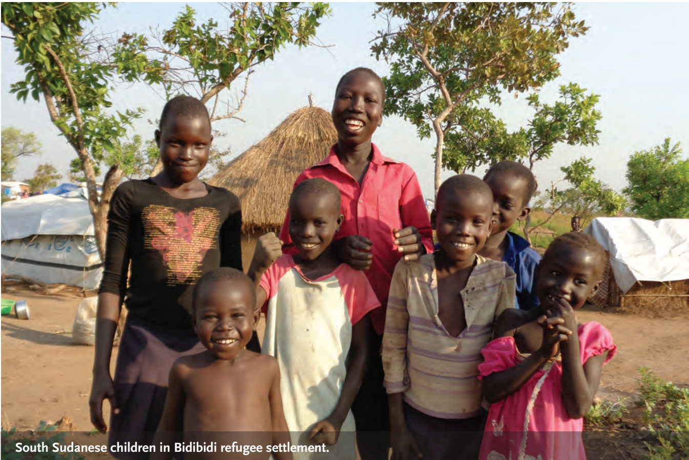
South Sudanese children in Bidibidi refugee settlement.

ingness to give refugees access to work and social services is commendable. However, a 2016 World Bank study determined that “Refugees and their host communities [in Uganda] remain vulnerable due to underlying poverty and vulnerabilities exacerbated by weak social services delivery, poor infrastructure, and limited market opportunities.” 21 RI’s own research echoed these findings: in the refugee-hosting areas that RI visited, humanitarian aid was clearly serving as a stopgap for proper development investment. If that aid is not replaced by longer-term support, both refugees and their host communities will suffer. The refugees’ protection could also be undermined if the needs of host communities are not met, and if conflict or opposition to receiving refugees results.