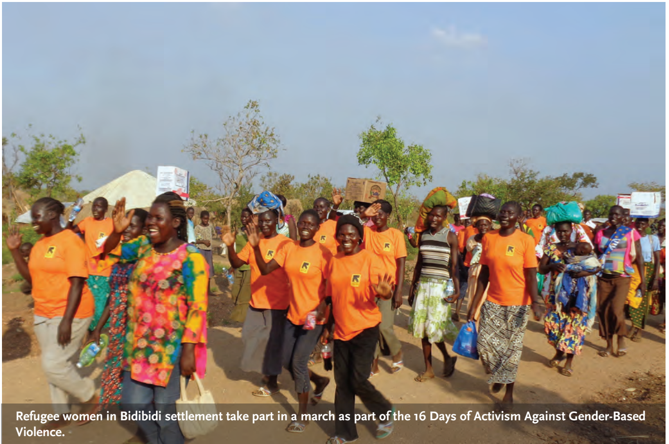
Refugee women in Bidibidi settlement take part in a march as part of the 16 Days of Activism Against Gender-Based Violence.

their own programs. Through multiple interviews with a great number of organizations intervening in the West Nile sub-region, it is RI's assessment that UN agencies and INGOs responding to the emergency were making deliberate and concerted attempts to mitigate risks to women and girls.