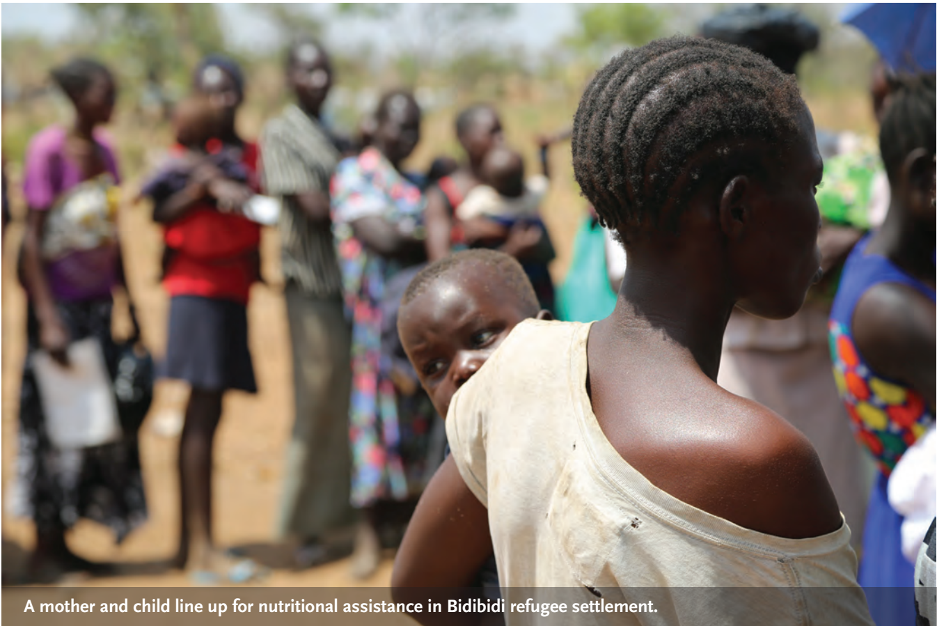
A mother and child line up for nutritional assistance in Bidibidi refugee settlement.

Of particular concern are the numerous and continuing reports of sexual and other forms of gender-based violence (GBV) perpetrated against civilians in South Sudan. In early December 2016, UN human rights investigators said that rape is being used as a tool for ethnic cleansing, and that sexual violence in South Sudan had reached “epic proportions.” 3 As recently as January 2017, the United Nations Mission in the Republic of South Sudan (UNMISS) and the Office of the High Commissioner for Human Rights (OHCHR) released a joint report in which they affirmed that serious rights violations, including sexual violence, committed by SPLA and SPLM/A-In Opposition continue in and around Yei. 4 In January 2017, the UN Refugee Agency (UNHCR) reported that refugees arriving from the Equatoria region cited rape and sexual abuse of women and girls as one of the primary reasons for flight 5 – something that refugees told RI repeatedly. In focus group discussions, women described to RI how rape is being used as a tax to be paid by women fleeing the country.