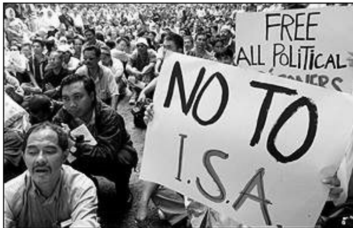
Demonstration against ISA

Webmasters were also among those picked up under the Internal Security Act in April 2001. 172 This Act allows for detention without trial for more than two years. In January 2003, news site Malaysiakini.com had the majority of its computers and servers confiscated under the sweeping Sedition Act. 173 Although the investigation has been completed and most of the computers returned, as of October 2003, Malaysiakini still does not know whether any charges will be brought against it. 174