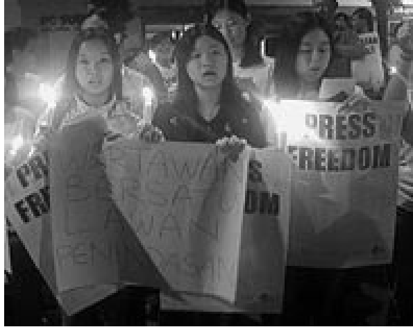
Demonstrators gathered outside the office of the independent news website Malaysiakini.com after the police raided the site of the site's office