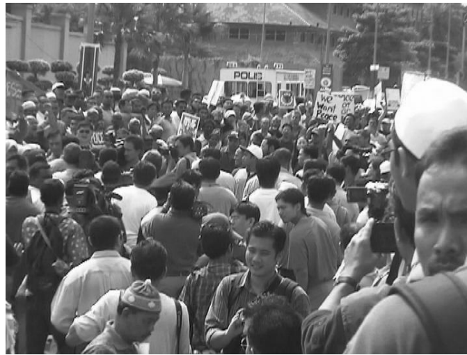
Media covering demonstration in Kuala Lumpur

dailies for the first time in over 20 years. The Leader and The Sun both started up in 1993, with the urban-based free sheet Leader closing after a few months due to financial problems.