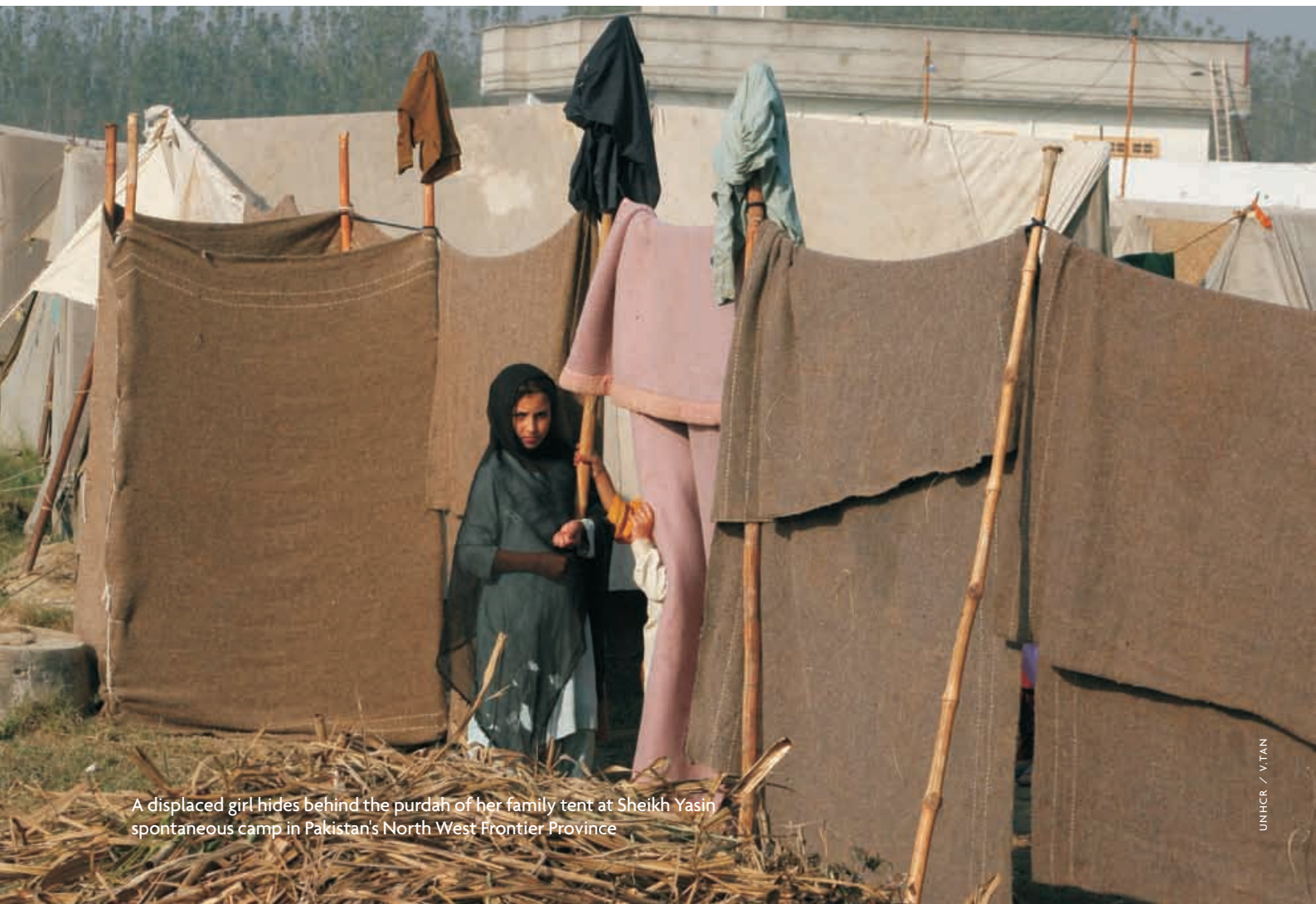
A displaced girl hides behind the purdah of her family tent at Sheikh Yasin spontaneous camp in Pakistan's North West Frontier Province

Water: Water and sanitation remained among the main concerns of Afghan refugees and hosting communities in 2008. Several disputes between refugees and host communities over scarce water resources required interventions by the refugee-run Water and Sanitation Committees, which also performed a quarter of all the major repairs on water schemes. Where necessary, water sources were cleaned and minor wells were repaired.