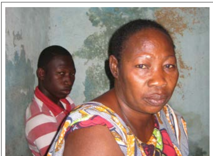
Thousands of Malians who sought refuge in southern cities during the last year of turmoil are starting to go back north. Others are waiting for reassurance that it is truly safe enough to go home.

Mali has engaged in a process of slow recovery from the 2012 Tuareg and Islamist takeover of the north and March coup d'état. Dramatic events in 2012 and early 2013 plunged the country into complex security, political and humanitarian crises, causing the internal displacement of hundreds of thousands of people. Today, Malians and the international community have guarded confidence regarding the near future.