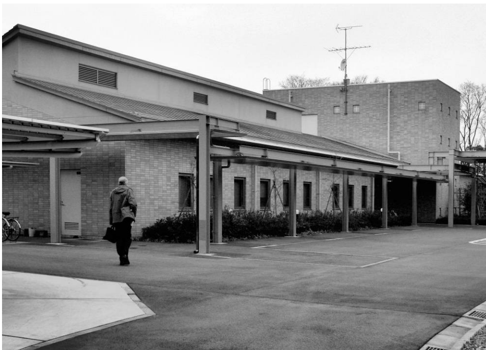
Tokyo Forensic Unit is one of more than 30 such units throughout the country established to allow for the evaluation of the mental health of detainees. The majority of residents in the Tokyo Forensic Unit are diagnosed with schizophrenia.

The policy also affects families of death row prisoners who are not told of the execution until after it has occurred. In one case, a mother arrived at the prison to visit her son to be told to come back later. When she did, she was told that he had been executed. 101 Again the rationale for this cruel policy is explained in benevolent terms for both family and prisoner: