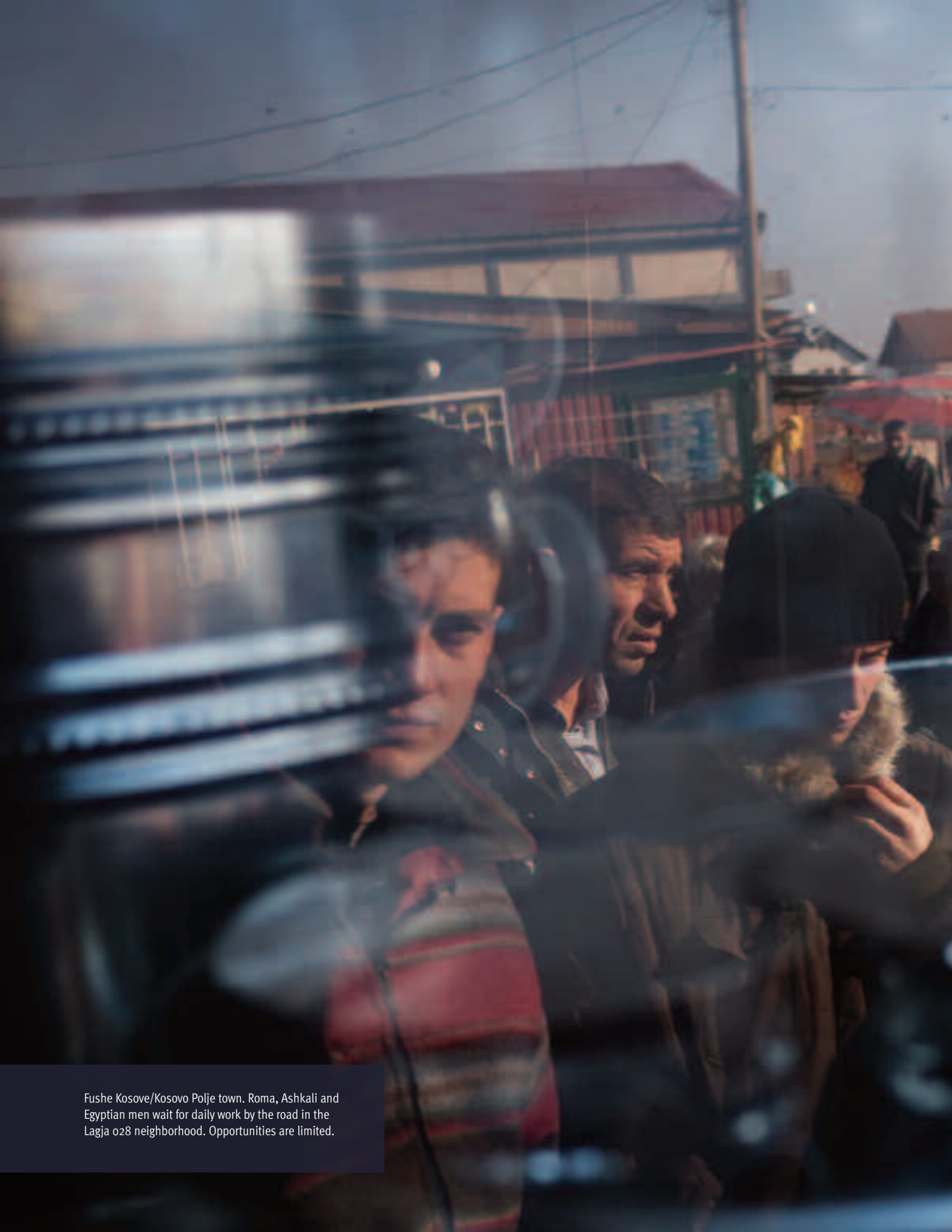
Fushe Kosove/Kosovo Polje town. Roma, Ashkali and Egyptian men wait for daily work by the road in the Lagja o28 neighborhood. Opportunities are limited.