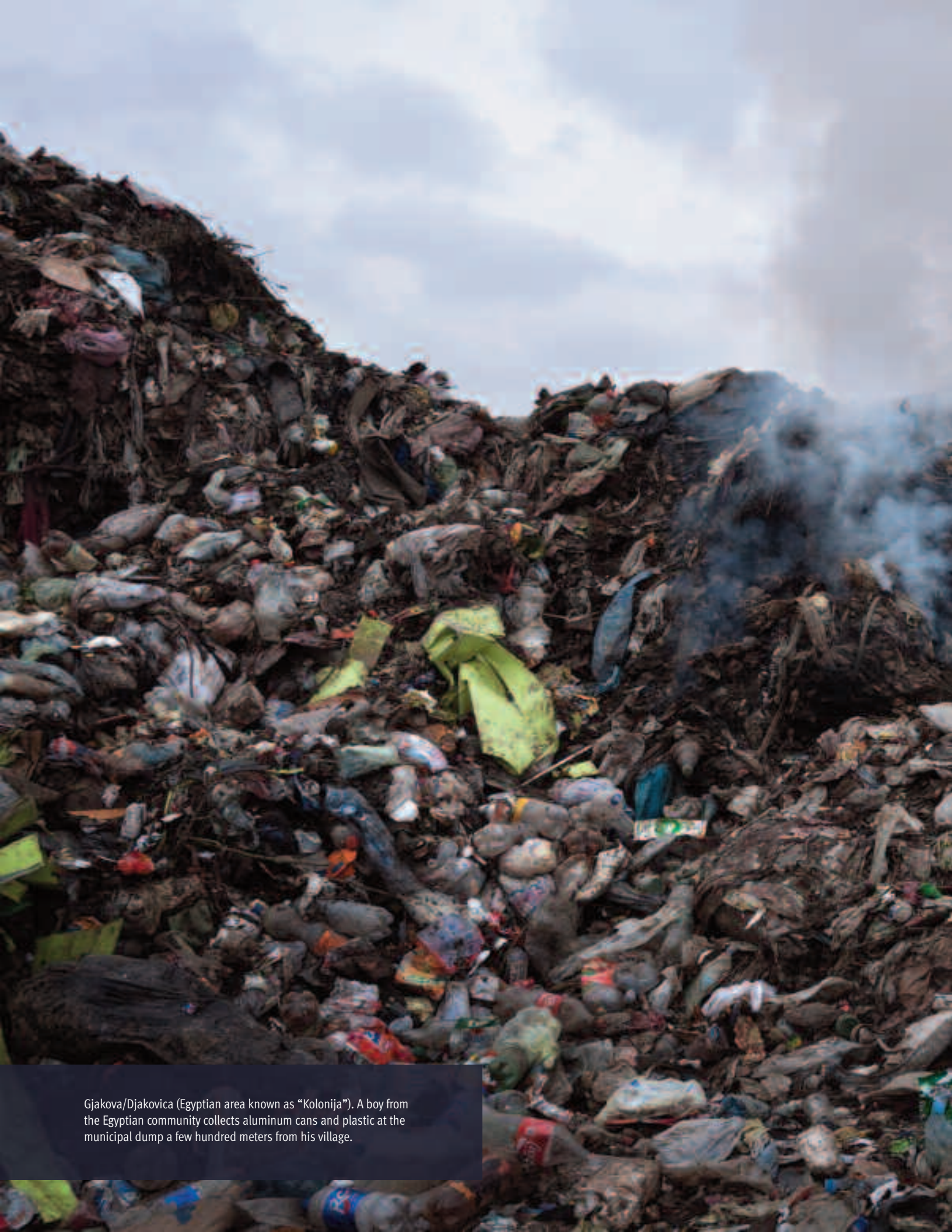
Gjakova/Djakovica (Egyptian area known as “Kolonija”). A boy from the Egyptian community collects aluminum cans and plastic at the municipal dump a few hundred meters from his village.