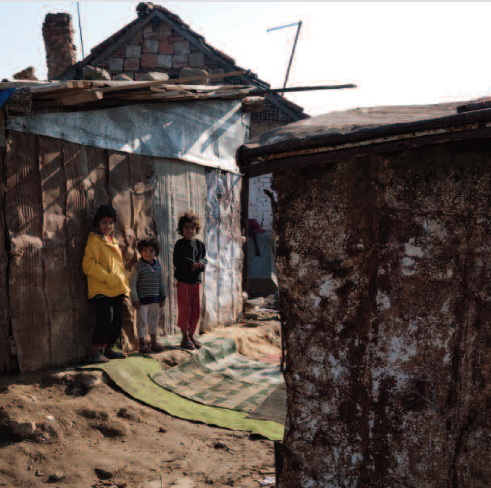
Dubrava area, Ferizaj/Urosevac town. This Roma neighborhood is extremely poor. None of the adults work and few children are able to attend school.