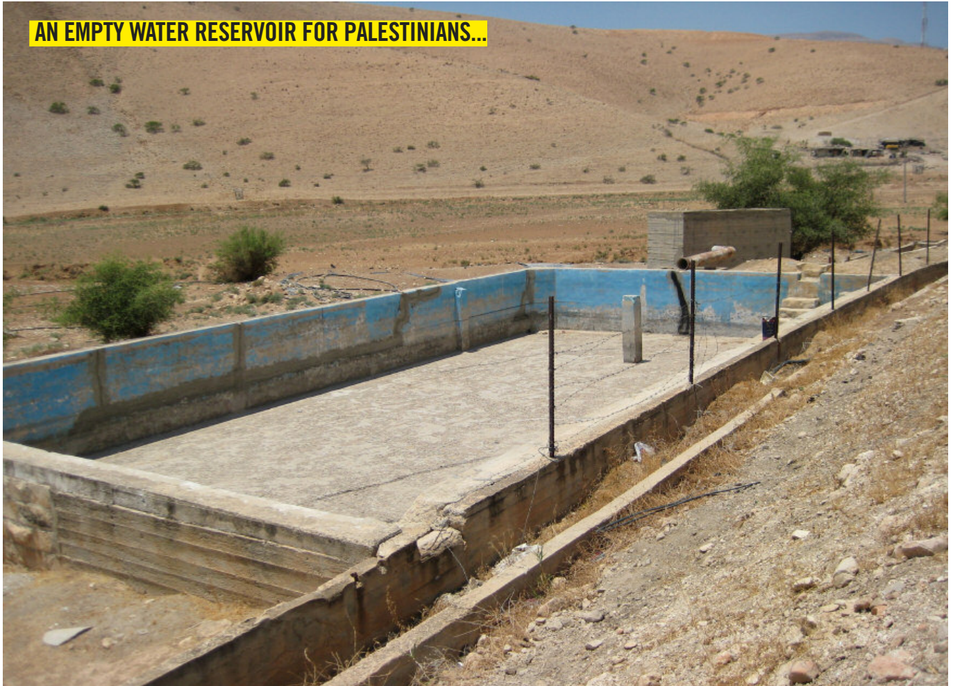
AN EMPTY WATER RESERVOIR FOR PALESTINIANS...