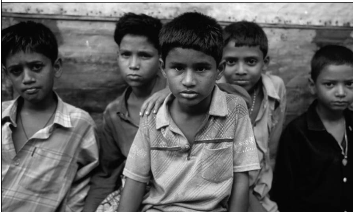
For these boys in a Dhaka camp for Urdu-speaking Biharis, Bangladesh is the only country they have ever known and Bengali is the language they have learned. Sometimes two, three, or even four generations suffer the deleterious impact of statelessness.

Some key actions that can be taken now are ensuring that every child is registered at birth, and identifying cases of disputed nationality and grant citizenship when a child would otherwise be stateless. (See page 21 for a full list of recommendations.) The United Nations can support such efforts by strengthening UNHCR to fulfill its mandate on statelessness, organizing a comprehensive survey to identify stateless populations, including children, and reinforcing UNICEF efforts surrounding birth registration and childhood education. As a world leader and international donor, the U.S. should make the prevention and reduction of statelessness among children part of the U.S. human rights agenda and provide financial and diplomatic support to UNHCR and UNICEF for their efforts to prevent and reduce statelessness.