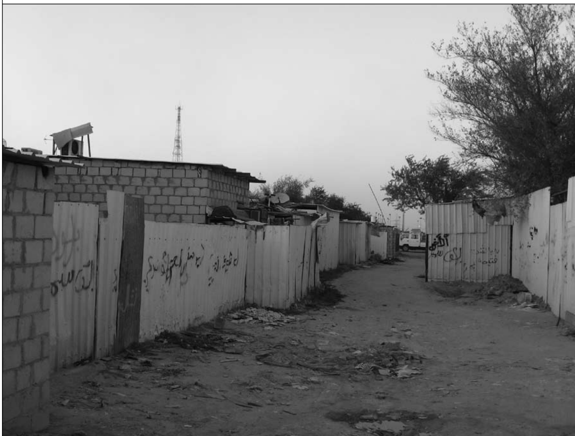
In Kuwait, many of the bidun live in virtual exile in neglected neighborhoods like this one. Due to a lack of status and formal employment, they frequently live in overcrowded squalid housing projects in Sulaibiya and Jahra, in Ahmadi and the rundown urban neighborhood of Jilib ash-Shiyukh.

At a briefing on the topic of stateless children in the U.S. Congress in 2007, a representative of Amnesty International related the case of one stateless family detained in the U.S. A man, his pregnant wife and four of their five children were arrested by Immigration and Customs Enforcement and placed in detention centers hundreds of miles away from each other. The U.S. Board of Immigration Appeals had denied their asylum claims and ordered their removal. The family’s five-year-old daughter was placed in a cell with her mother, but her eight-year-old and fourteen-year-old sisters were detained elsewhere together. The fifteen-year-old son was held separately from his siblings. Their father was separated from