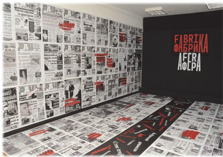
The “Words, Pictures and the Enemy” exhibition at the November 2013 regional Western Balkans media conference inaugurated by Montenegrin Prime Minister Milo Đukanović displaying front pages of three newspapers in Montenegro as examples of “bad” journalism. November 13, 2013.

Prime Minister Milo Đukanović has a history of engaging in verbal attacks against independent journalists and government critical media outlets claiming they are part of a “media mafia,” involved in organized crime and he has described journalists working for these outlets as “monsters,” “rats,” and “enemies of the state.” 107