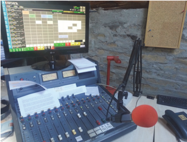
Interior of Radio 021 studio in Novi Sad, Serbia. October 4, 2014.

officials [ruling Serbian party] boycotted my show. Officially, they didn't tell me why but I was told by sources in SNS that they [regional SNS officials] had been instructed to boycott my show... I understood it as political pressure that I was pushed into a corner and I would have been forced to be one-sided in my reporting. As a result I decided to leave journalism because there is no space for independent journalists. 122