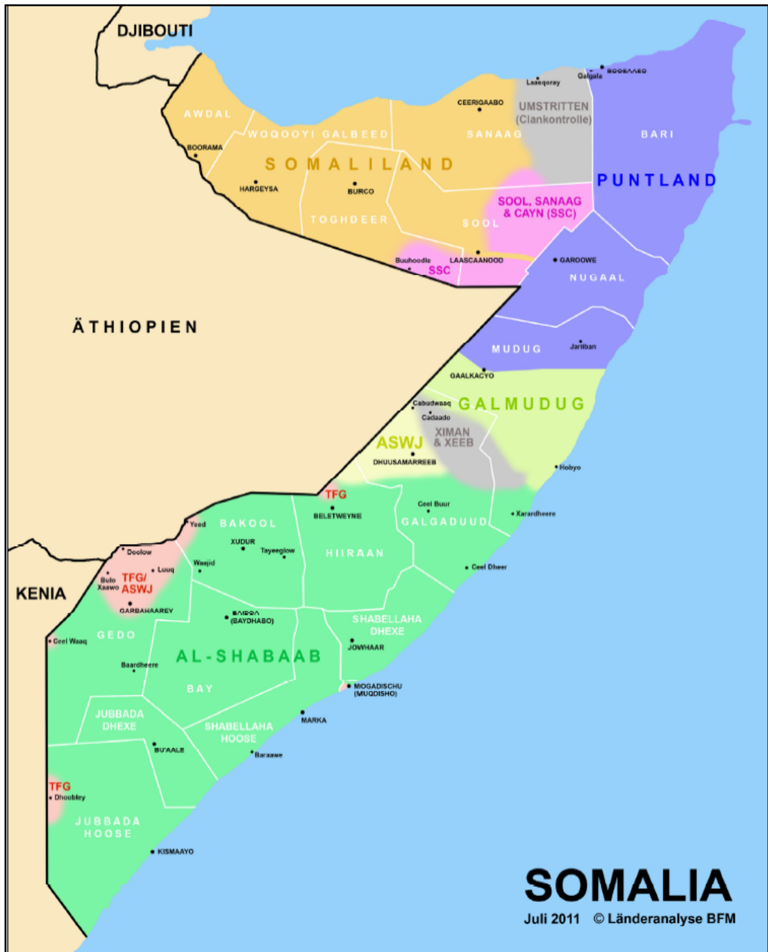
Control Zones in Somalia, July 2011 (BFM 2011).