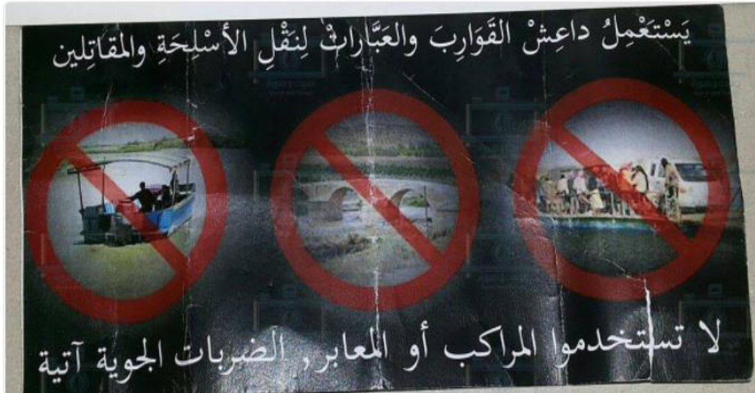
Leaflets dropped by the Coalition over Raqqa in March 2017.