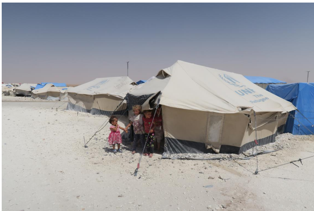
Children displaced by the battle in Raqqa sheltering in IDP camp in Ain Issa, northern Syria.

Syrian government forces lost control of Raqqa City to armed opposition groups including Ahrar al Sham and Jabhat al-Nusra in early March 2013, making Raqqa the first Syrian provincial capital from which government forces were expelled entirely since the beginning of the uprising in 2011. 9 After a brief power struggle with other armed groups, by the end of 2013 the IS had taken full control of the city, 10 which it held until June 2017, when the ongoing military operation to recapture the city was launched by the SDF and US-led coalition forces.