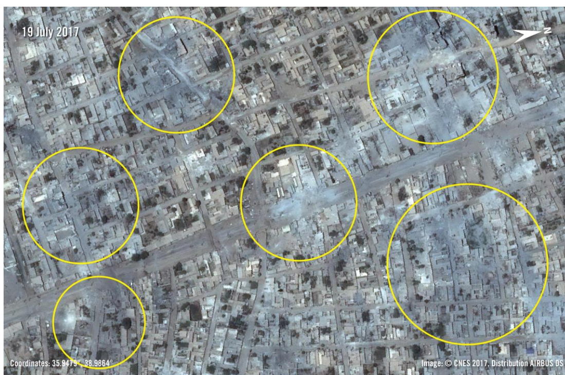
Raqqa, Ihsewa crossroad area. Imagery taken on 19 July 2017 after a series of strikes launched on 9 June. Yellow circles highlight some of the damaged areas. Coordinates: 35.9479°, 38.9864°.

It all happened in the space of a few minutes, sometime between 1 and 2pm, the shells struck one after the other. It was indescribable, it was like the end of the world – the noise, people screaming. If I live a 100 years I won't forget this carnage. Artillery shells are hitting everywhere, entire streets. It is indiscriminate shelling and kills a lot of civilians". 21