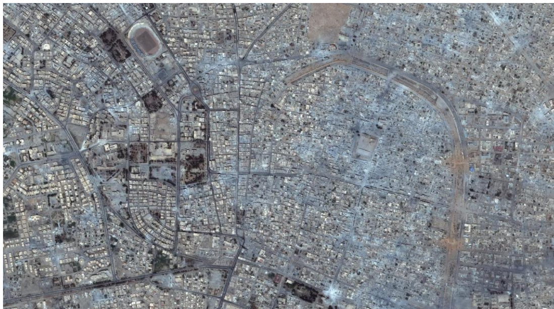
Raqqa Old City overview. Imagery taken on 19 July 2017.

IS fighters, for their part, use crude unguided projectiles, including locally manufactured mortars, and a host of improvised explosive devices (IEDs), including car bombs, all of which pose an inherent lethal danger to civilians. Moreover, the danger for civilian residents of getting caught in crossfire between the warring sides is all the more acute as IS fighters have been redoubling efforts to prevent civilians from leaving the city, using them as human shields while they launch attacks against SDF and coalition forces from amongst the