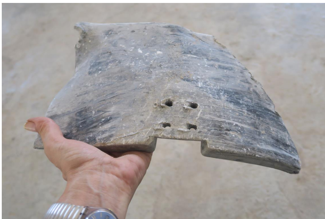
Fragment of a guidance fin from an American-designed Joint Direct Attack Munition (JDAM), which is a GPS-guided air-dropped bomb. From one of the bombs used in an air strike in Hukmya/Salhiya area northwest of Raqqa killed 14 members of a family and severely wounded two others on the evening of 11 May 2017. Eight of those killed in the attack were women and five were children. The two who were wounded were both children.

Amnesty International researchers visited the site and from the pattern of destruction there seems little doubt that the house was destroyed by air strikes. At the site, the organization’s researchers recovered a fragment which weapon experts identified as a guidance fin from an American-designed Joint Direct Attack Munition (JDAM), which is a GPS-guided air-delivered bomb. 29 It is however not clear why the house was targeted. According to the two survivors of the strike, two children aged 14 and 15, no one was in the house other than the family members who lived there – eight women, seven children and one man. Amnesty International could not establish whether IS fighters might have been hiding in or launching attacks from the fields around the house before/at the time of the strike. However even if this was the case, it would not have constituted ground for targeting a house full of civilians.