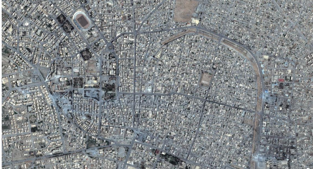
Raqqa Old City overview. Imagery taken on 2 June 2016.