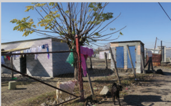
Top: The interior of PL's shack in Nkaneng. Bottom Right: Shacks in Nkaneng informal settlement, with PL's house on the left, with the latrine structure to the right. Bottom Left: View of PL's yard, shared with five other families.