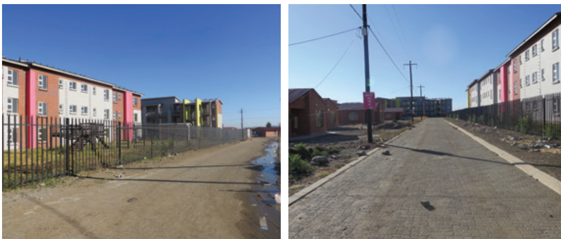
Apartment blocks and houses built by the government on land donated by Lonmin

The government housing project at Marikana comprises social housing including what are known as Breaking New Ground houses and community residential units (CRUs, which are apartments). Both of these types of housing are intended for people who earn below a certain income threshold. To date the government has built 292 houses and 252 CRUs at Marikana. The intention is to build a total of 2,600 housing units, although the deadline for this work to be completed is unclear.