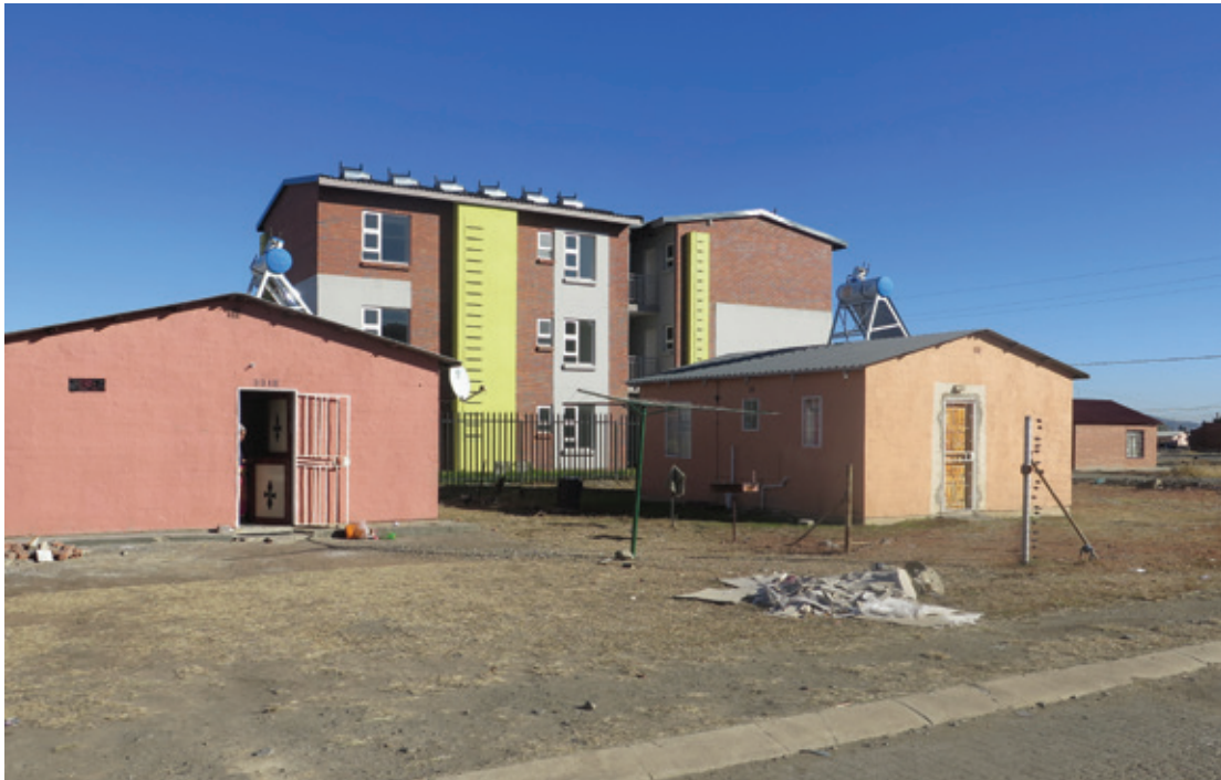
TOP: Two of the three show houses built by Lonmin (the multi-story structure in the background is not one of the houses). BOTTOM LEFT: The third of the three show houses. BOTTOM RIGHT: close up of one of the three show houses.