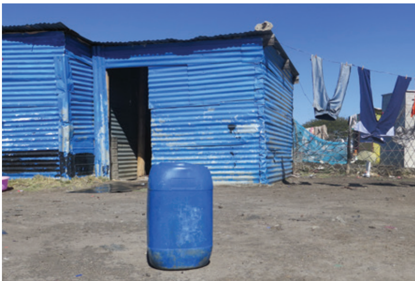
Standard-sized jerry can used by Nkaneng residents to collect and transport water to their homes.

Lonmin's main contribution with regard to living conditions in the areas surrounding its operations are support to water, sanitation and waste collection. A number of projects have been delivered, but the immediate areas such as Nkaneng remain without any viable amenities (many people do not have access to