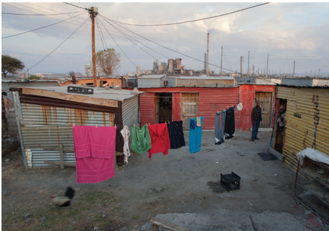
Nkaneng informal settlement near Lonmin’s Roland mine shaft.

In interrogating the issue of the housing available for mine workers at Marikana the Farlam Commission stated: