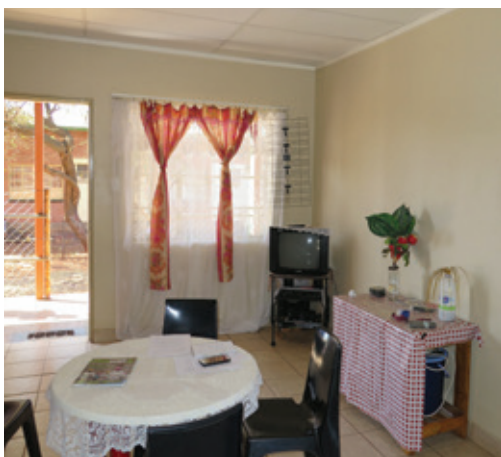
Top left: Illegal electricity connections in Nkaneng settlement. Top Right: People living in Nkaneng are forced to make use of communal water towers and communal taps. Due to poor roads and infrastructure, collecting this water can be difficult. Some residents prefer to wash clothes etc at the water source. Bottom Left: Interior of two bedroom unit in converted hostel.