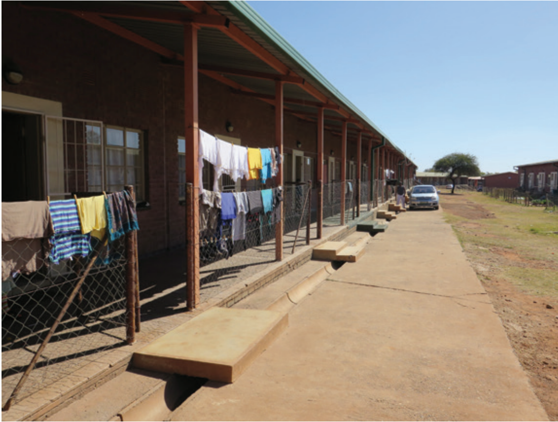
Exterior of converted hostels (single bedroom units).

Overall, between 2006 and 2012, Lonmin moved from providing inadequate accommodation to 8,000 76 employees in hostels to providing more adequate accommodation to approximately 2,500 employees in converted hostels. The hostel conversion programme, while welcome, has actually increased the number of men looking for accommodation in the locality while Lonmin has failed to provide the additional housing it promised.