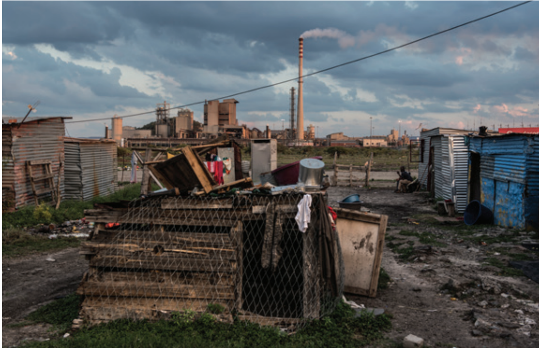
Nkaneng settlement with Lonmin mine in the background.