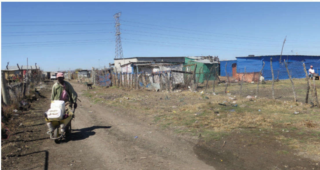
Nkaneng resident returning home with water collected from a communal tank.

This chapter examines the housing conditions for mine workers at Marikana.