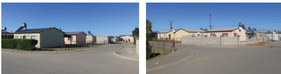
Houses built before 1994. Some have been refurbished by recent owners.

In 2011, the year when, based on the SLP, the 5,500 houses should have been constructed, Lonmin's Sustainability Report states that: "To enhance employee wellbeing we have undertaken to provide affordable housing to our employees." 85 The report goes on to state: "To date we have built 1,728 houses." 86 This information is accurate but misleading because it refers to houses built before 2006, and has nothing to do with the SLP commitment to build 5,500 homes. The statement in the Sustainability Report is un-dated but it is noteworthy that they say they "have built" the houses.