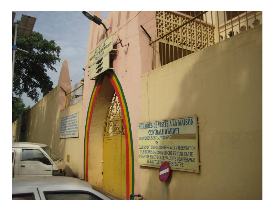
Bamako Prison