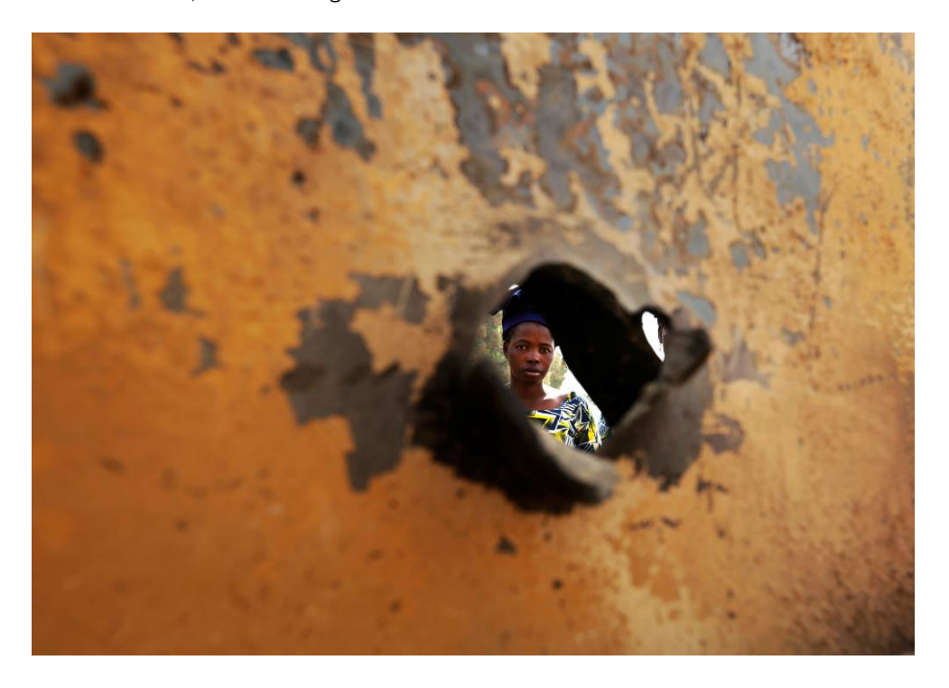
A woman is seen through a bullet hole of a vehicle, believed to belong to Islamist rebels and destroyed during French air strikes, in the recently liberated town of Diabaly January 24, 2013.

"I joined MUJAO after I heard they were recruiting people for money. I did not ask for my parents' permission. The MUJAO never paid me but I could eat my fill ("manger a ma faim"). I followed a military training program for two months with MUJAO in Gao at the Cour des Douanes (Customs' house) (...) When I heard on the radio that anyone fighting with MUJAO should surrender, I went to the gendarmerie in Gao."