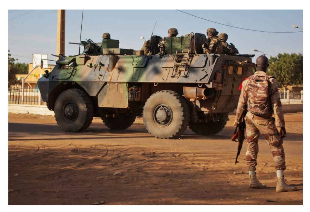
A Malian soldier watches a French armoured vehicle drive by during gun battles with armed groups in the northern city of Gao, Mali February 10, 2013.

Integrated Stabilization Mission in Mali (MINUSMA), it is essential to ensure that the Malian army and any other armed forces deployed in Mali respect and protect human rights. It is critical to reassure the populations living in the north of the country and to halt abuses targeting civilians. Otherwise, the hundreds of thousands of people who fled the region to seek refuge in neighboring countries will remain reluctant to return home. Such a situation would further hinder the resolution of the political and humanitarian crisis that erupted in January 2012.