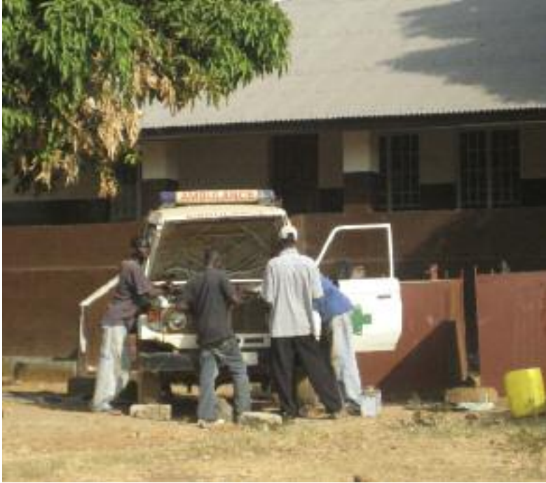
A broken ambulance – women needing to reach a hospital will have to find another means of transport.

personal travel, charging fees for their use and keeping the money, and claiming reimbursement for non-existent repairs. 82