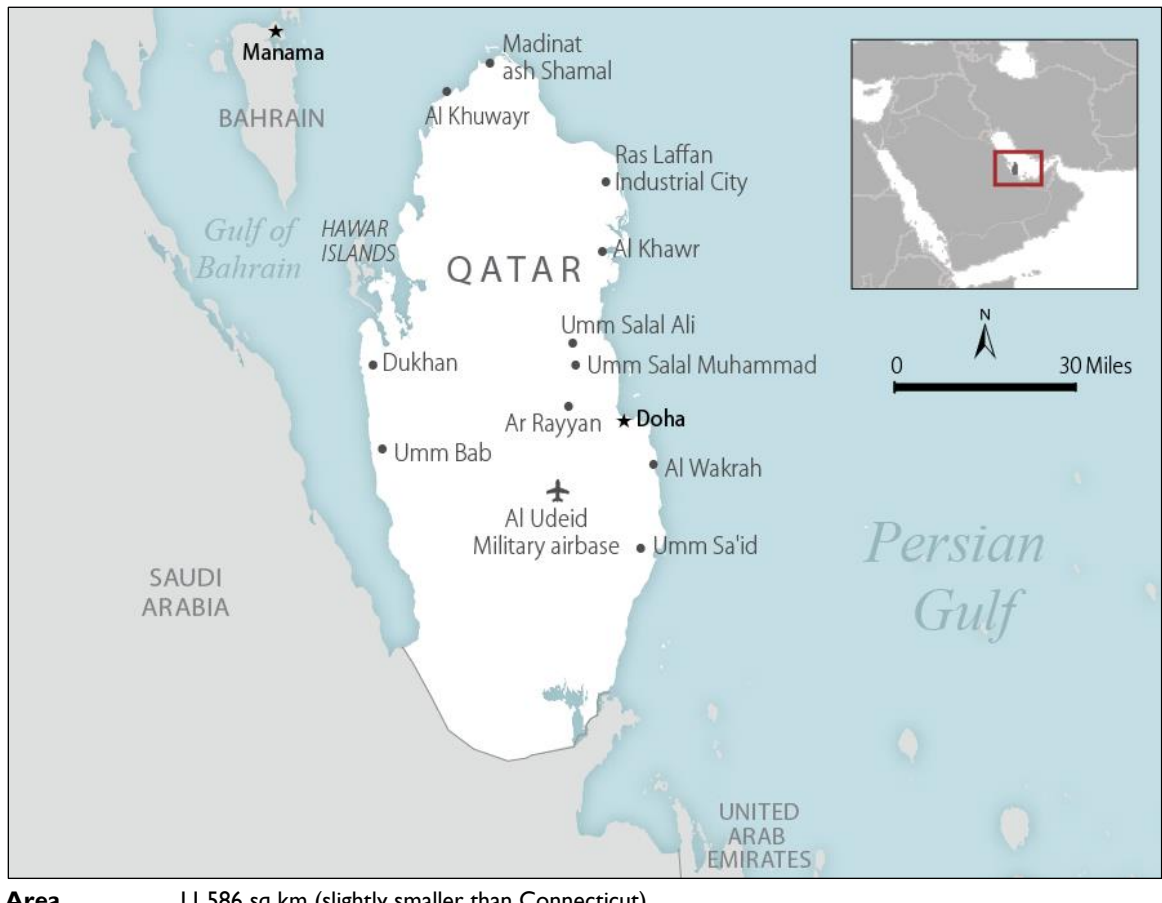
Figure I. Qatar At-A-Glance