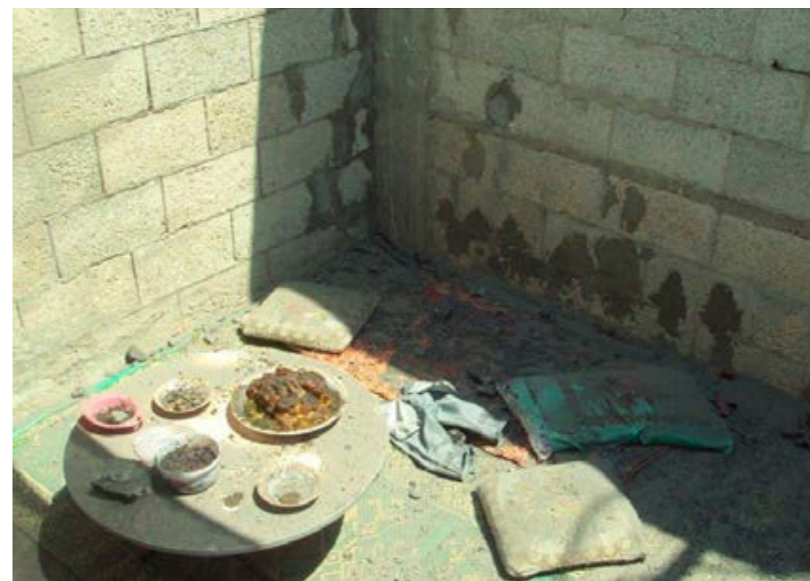
← © The home of the Abu Jame' family in southern Gaza. They were about to eat when an Israeli aircraft bombed their house killing virtually the entire extended family, 20 July 2014.