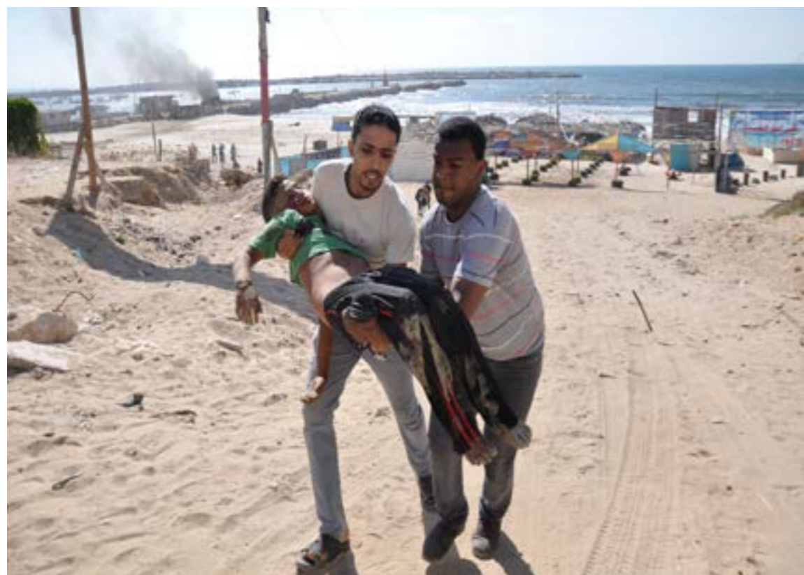
← © Palestinians carry the body of a boy who was killed in an air strike by the Israeli army on a beach in Gaza City on 16 July 2014. Four children were killed and two other children were badly wounded in the strike.