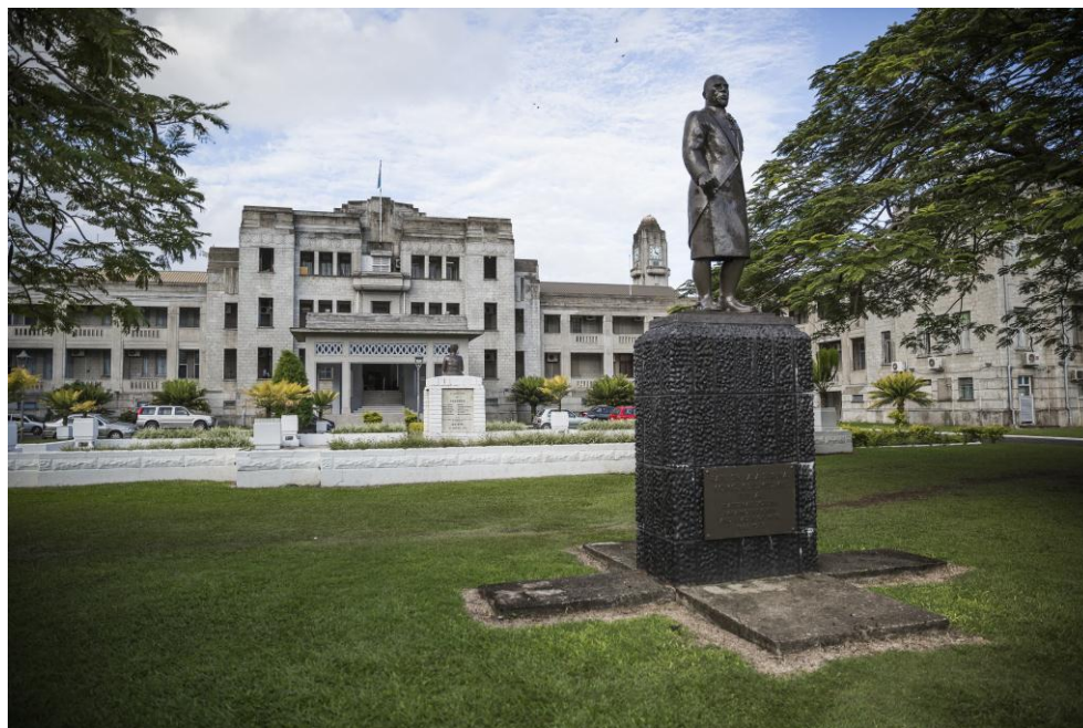
High Court of Fiji, Government Buildings, Suva, Fiji. An independent judiciary is critical to ensuring that victims of human rights violations can seek redress through national courts. July 2014.

Closely linked to the right to a remedy, is the right to a fair hearing before an impartial tribunal. Amnesty International's report Fiji: Paradise Lost, A tale of ongoing human rights violations April-July 2009 , highlighted a number of concerns regarding interference by government with judges and lawyers contrary to international law and standards, including the arbitrary removal of judges, lack of security of tenure and reports of executive interference in the judiciary. Collectively, this undermines the independence of the judiciary. An independent judiciary is critical to ensuring that victims of human rights violations can seek redress through national courts.