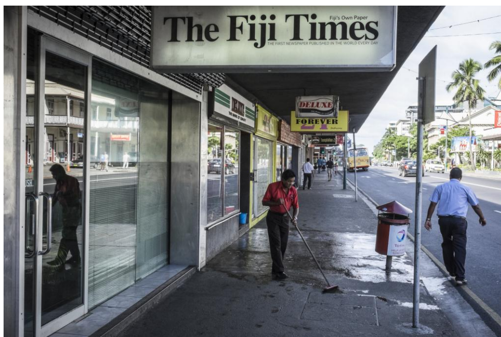
Picture of Fiji Times office, Suva, Fiji. July 2014. A culture of self-censorship has become entrenched in media reporting.

In addition to this, Amnesty International has expressed concern that contempt of court proceedings have been used to stifle the right to freedom of expression, which includes the right to be critical of institutions, such as the judiciary. 16