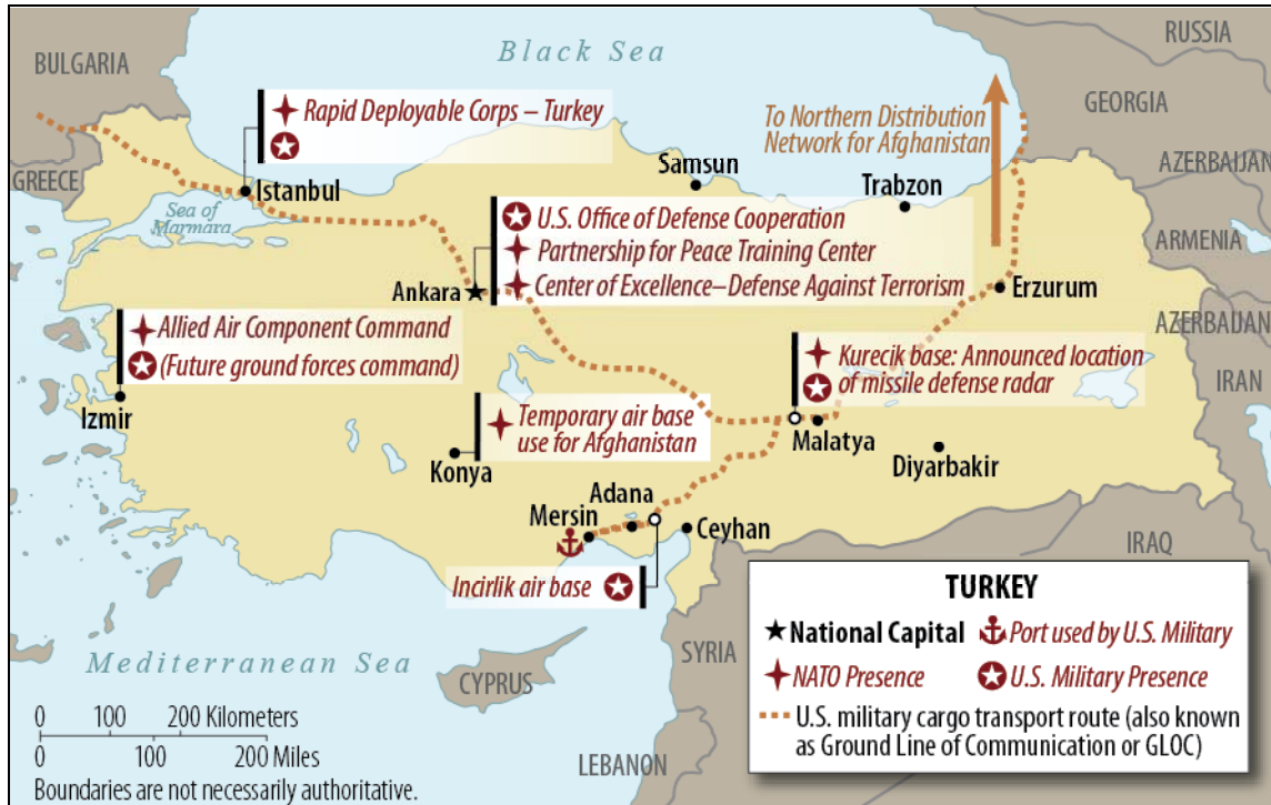
Figure 3. Map of U.S. and NATO Military Presence and Transport Routes in Turkey