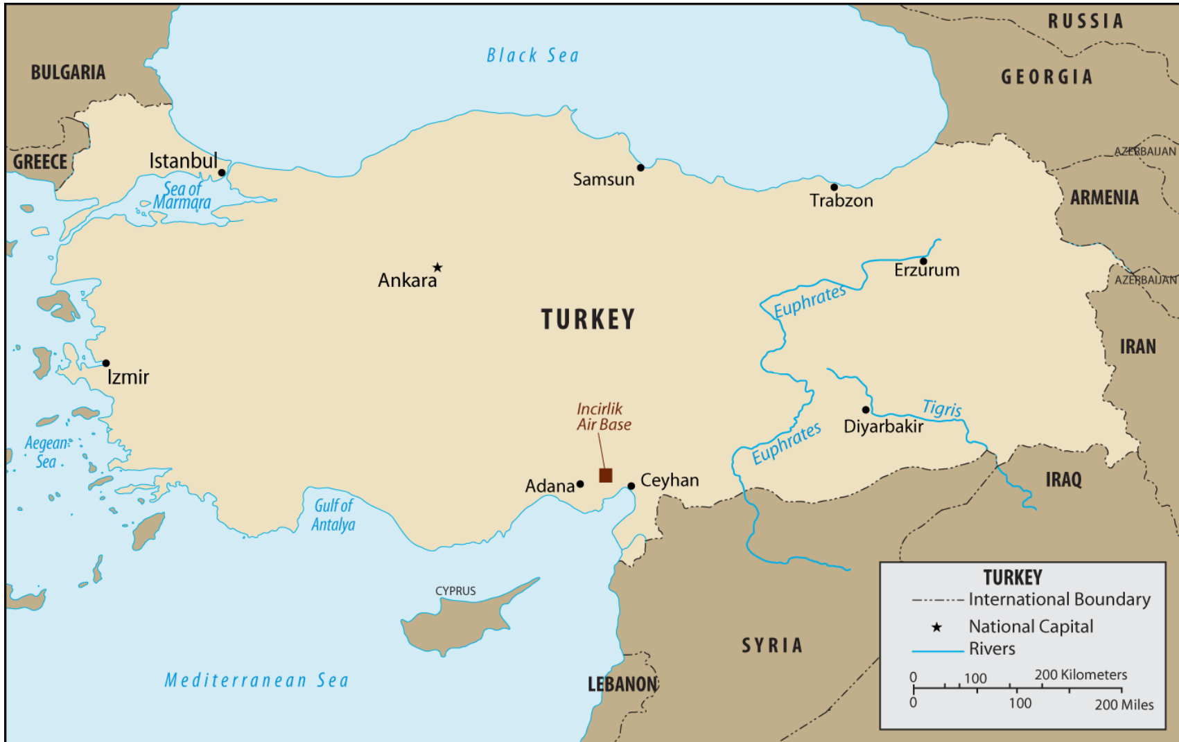
Figure I. Turkey and Its Neighbors