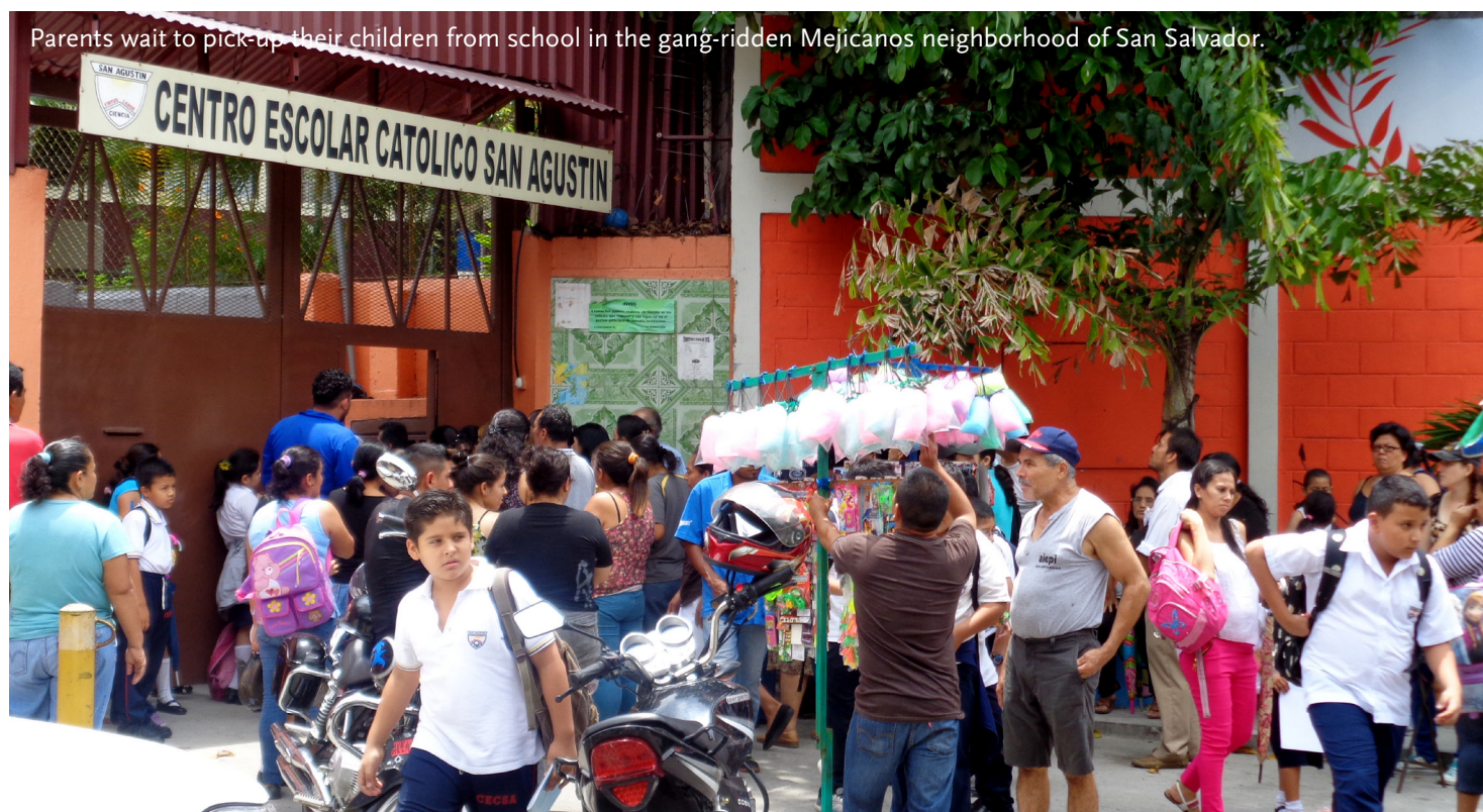
Parents wait to pick-up their children from school in the gang-ridden Mejicanos neighborhood of San Salvador.

When thinking about where to relocate and resettle families, the government should also consider access to education. Going to school can help to restore a sense of normalcy in the lives of displaced children simply because it creates a predictable routine, and it