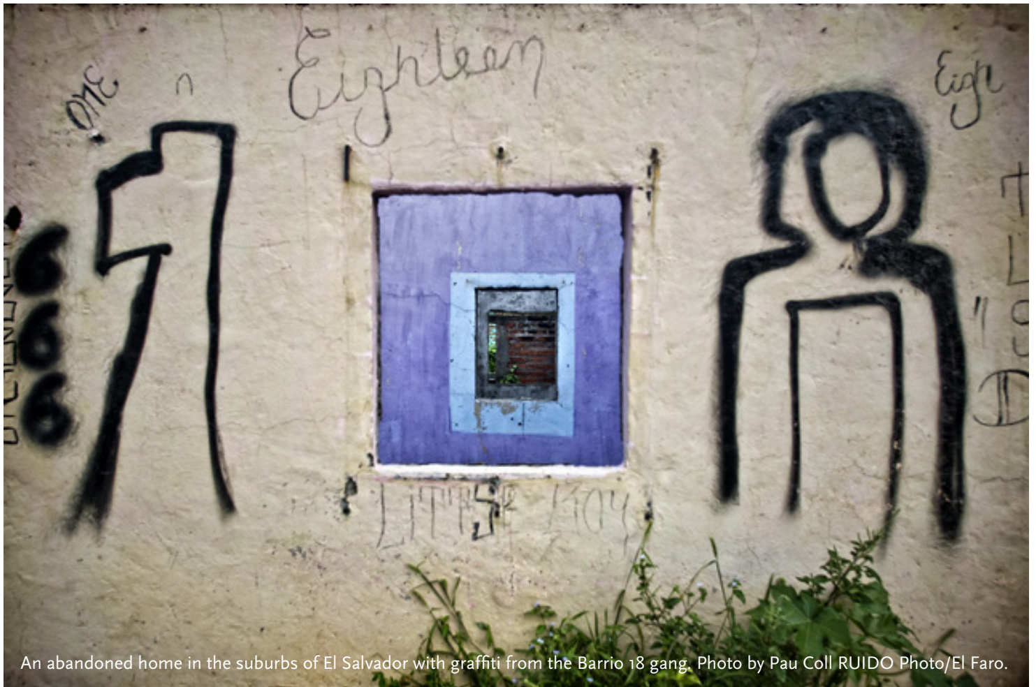
An abandoned home in the suburbs of El Salvador with graffiti from the Barrio 18 gang.

rights violations, persecution, and torture. Right now, El Salvador is unable to protect thousands of its citizens and this deficit is resulting in growing requests for international protection.