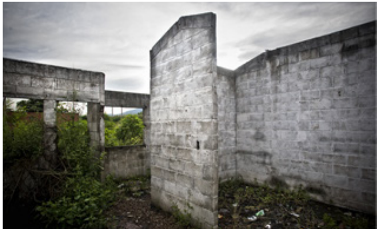
Homes abandoned by families fleeing gang violence.