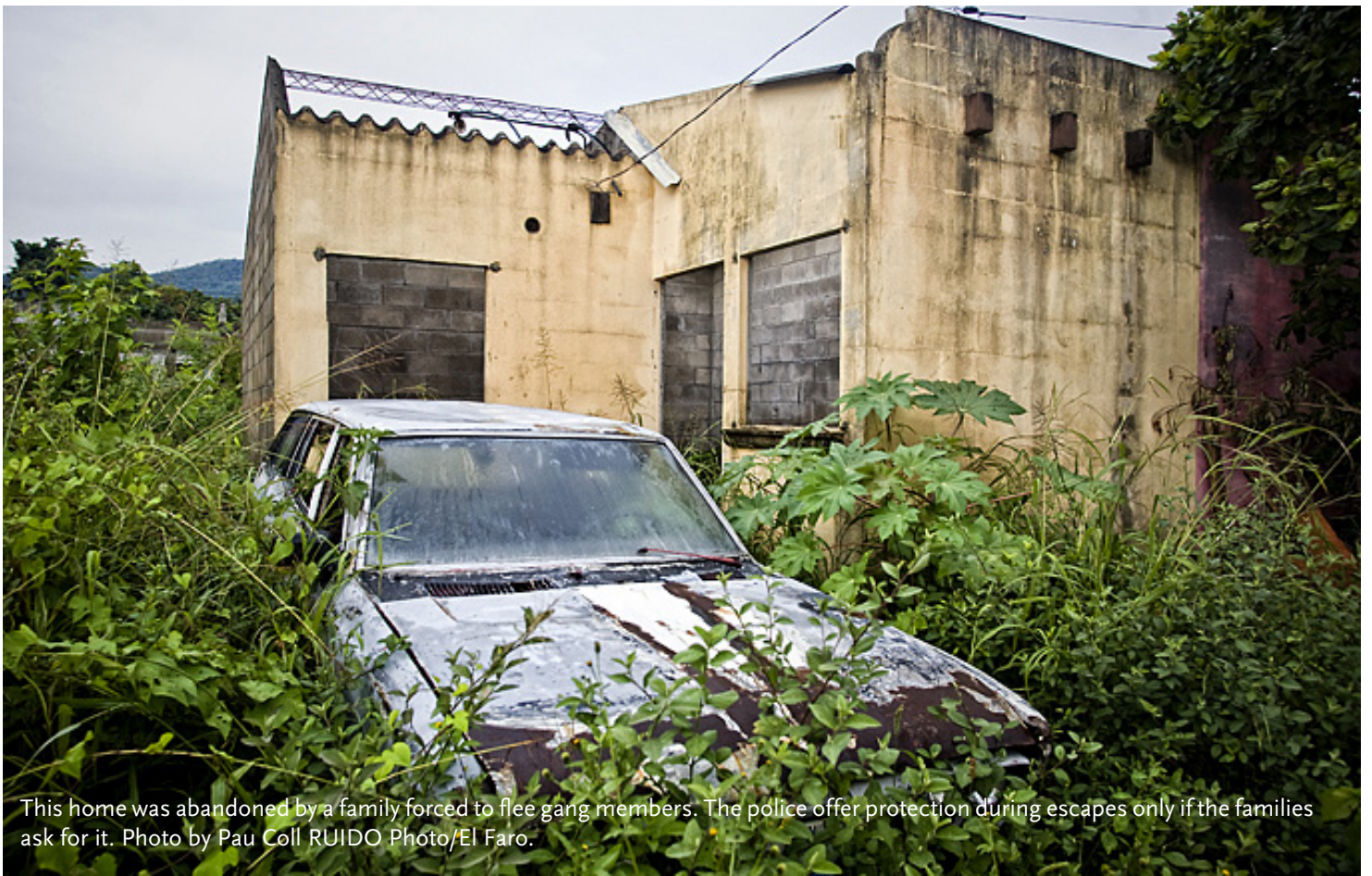
This home was abandoned by a family forced to flee gang members. The police offer protection during escapes only if the families ask for it.

so many people on the run go to women’s and children’s centers first, and arrive at CSOs only after they have been told that government shelters will not accept them.