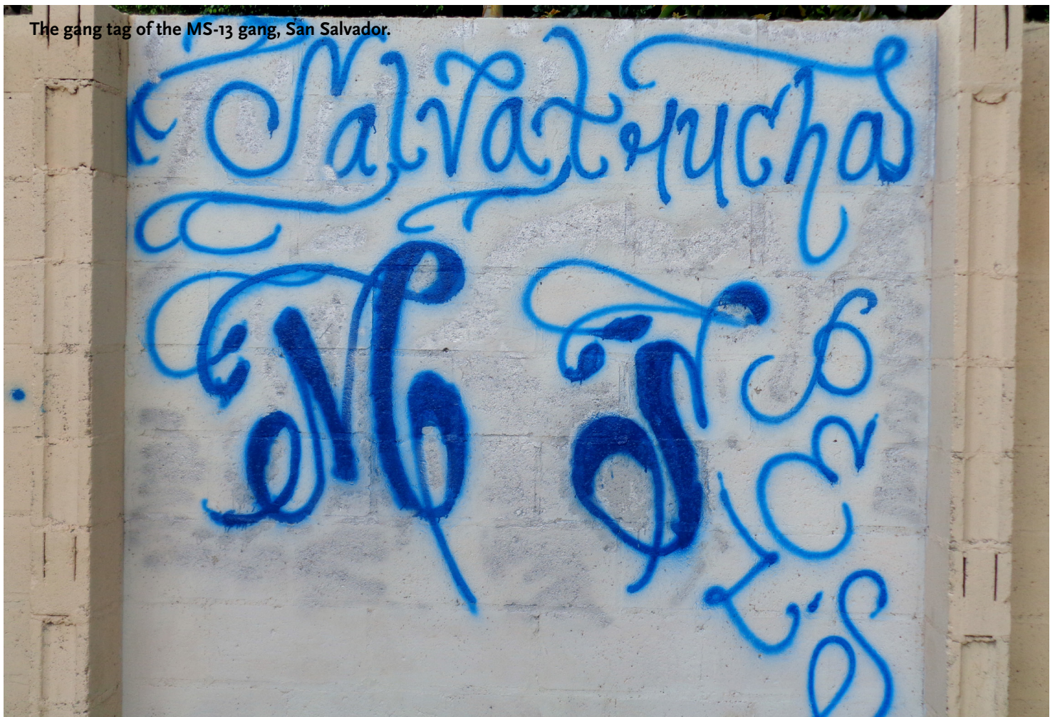
The gang tag of the MS-13 gang, San Salvador.

The Central American Minors (CAM) Refugee/Parole was created in direct response to the unprecedented amount of unaccompanied minors who arrived at the U.S. border in 2014. Although described as a refugee program, only children who have a parent legally present in the U.S. are eligible to apply. If they are allowed to enter the U.S., children can then apply