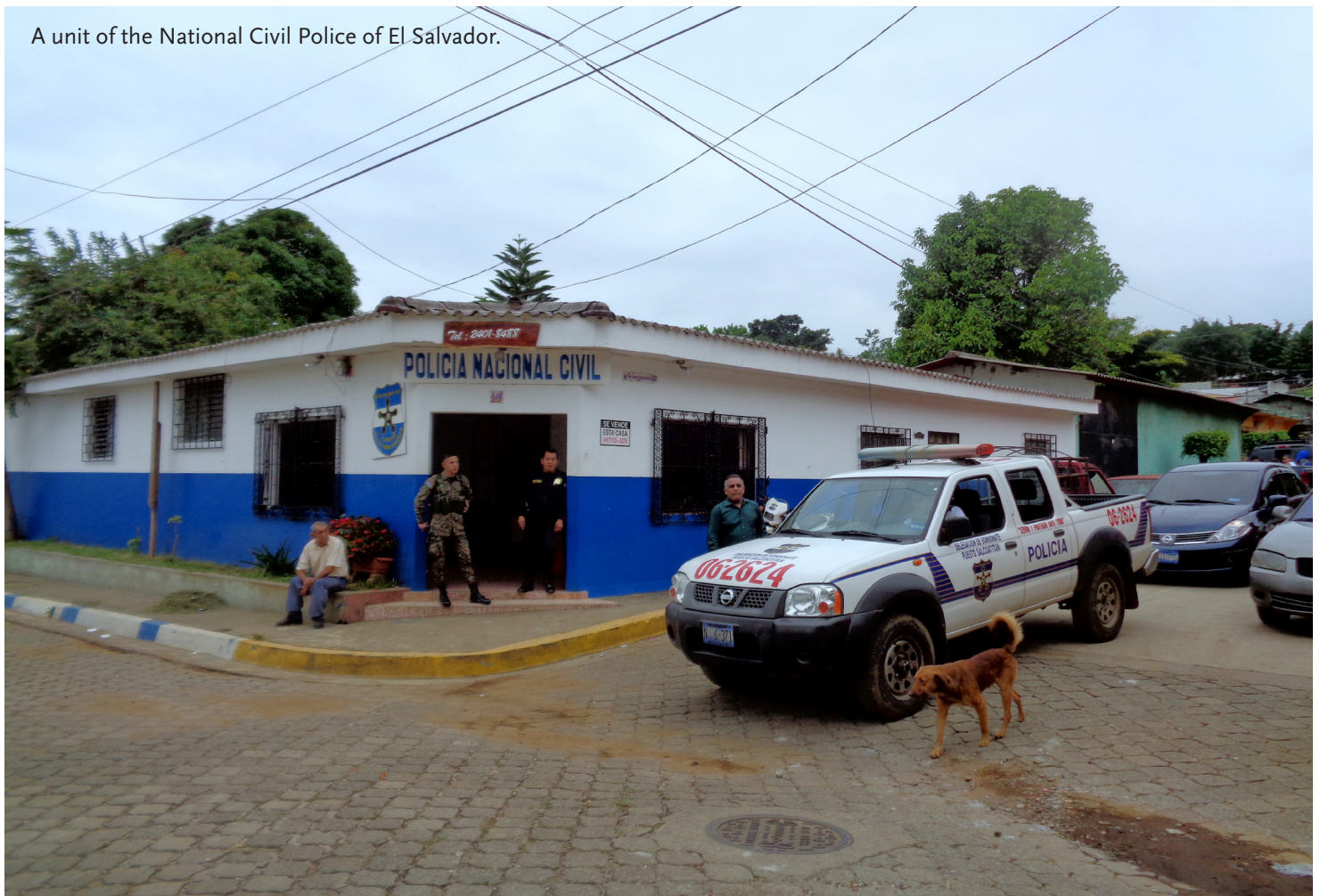
A unit of the National Civil Police of El Salvador.

Countries that receive Salvadorans in the region must be generous and flexible in their support of people fleeing gangs. A variety of measures could extend protection to those who need it without overextending neighboring states. With the support of UNHCR, states should ensure that all Salvadorans expressing a fear of serious human rights violations, persecution, or torture be given the opportunity to articulate their fear of return before an officer authorized to adjudicate asylum applications consistent with the Refugee Convention, Cartagena Declaration and Brazil Plan of Action, and other complementary forms of protection. The UNHCR should also help states build the capacity to receive and absorb refugees, as for many of these countries, the arrival of large numbers of refugees from the Northern Triangle is a new phenomenon.