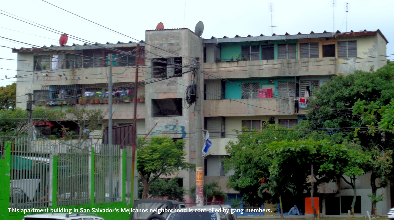
This apartment building in San Salvador's Mejicanos neighborhood is controlled by gang members.

“In the past, once the gangs found people, they would threaten them. Now they just kill them.”