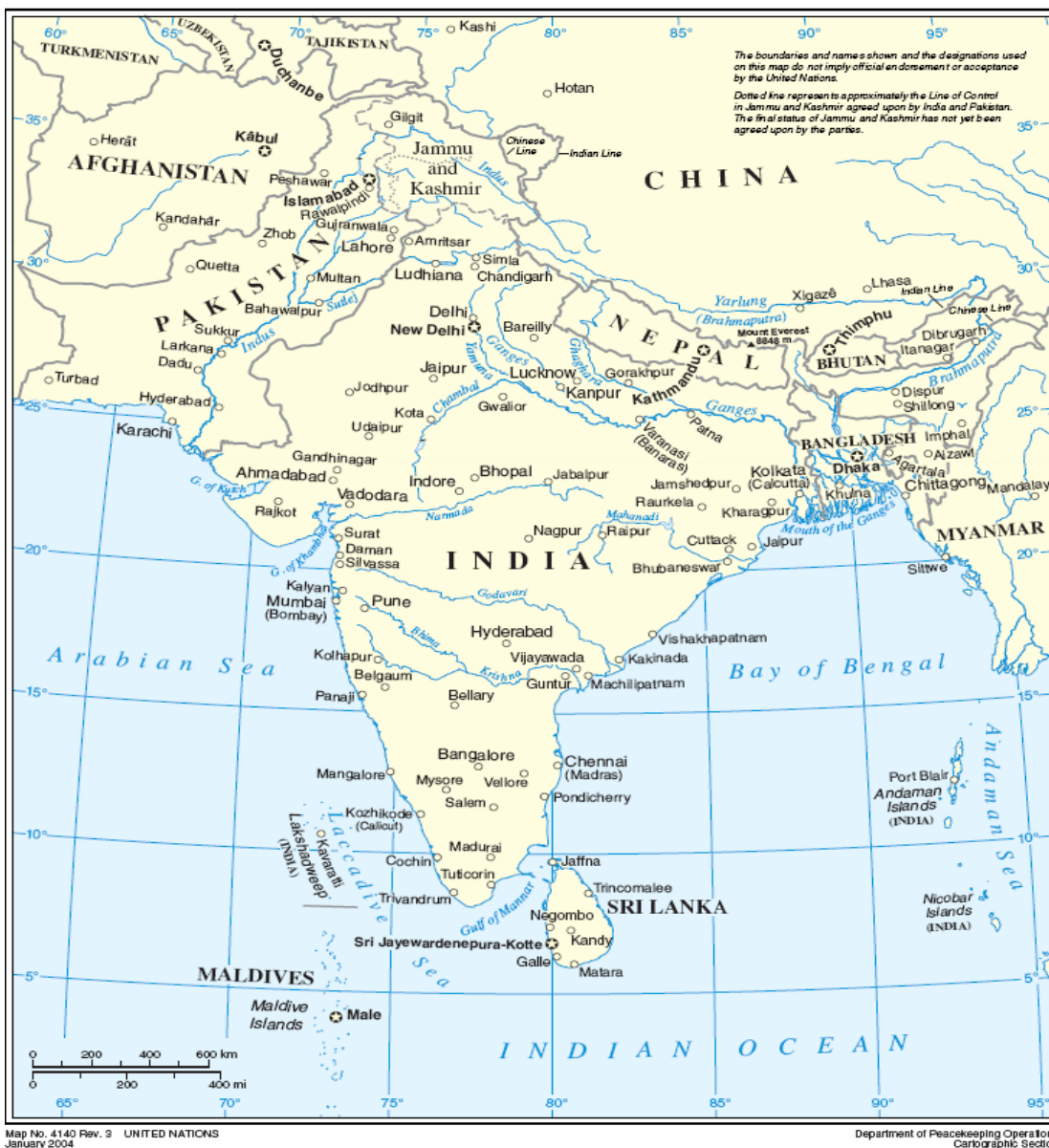
Source: UN Department of Peacekeeping Operations, Cartographic Section http://www.un.org/Depts/Cartographic/map/profile/seasia.pdf [6c]