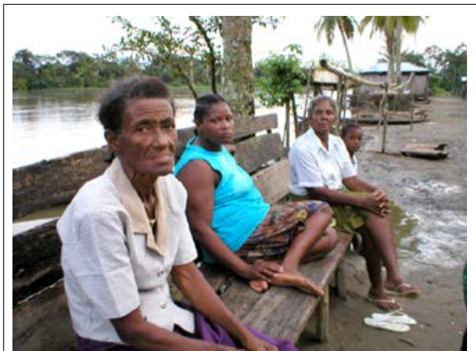
Women leaders rest following a return to their river communities in Chocó department

Roughly 300,000 people are internally displaced each year. In 2012, people fled from, or arrived to, nearly three quarters of the country's municipalities. Military confrontations between armed groups and the national army as well as direct threats to individuals and communities cause the vast majority of displacements. Widespread abuses, including the recruitment of minors, sexual violence, anti-personnel mines, extortion and the targeting of human rights defenders also force the flight of many Colombians.