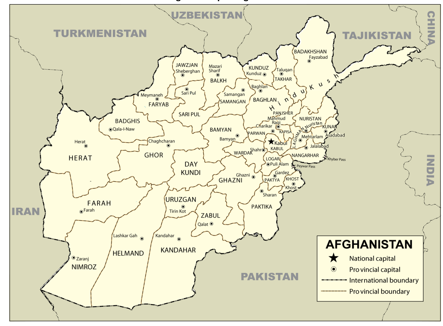
Figure I. Map of Afghanistan