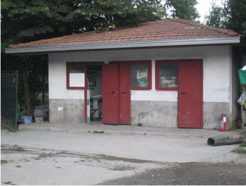
Toilet facilities in the authorized camp of Via Idro, July 2011.