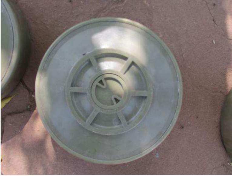
Type 72 anti-vehicle landmine reportedly seized from SSLA forces in Mankien during April or May 2011; photographed at SPLA headquarters, Rubkhona, Unity State, 27 January 2012. The same type has been recovered by international de-miners from roads elsewhere in Unity State during 2011.