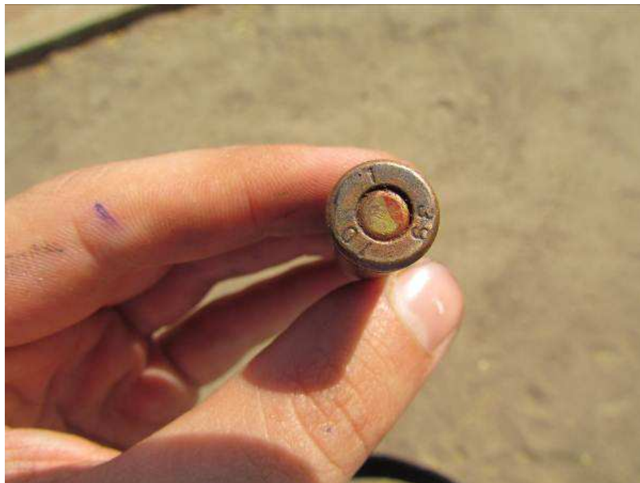
2010-manufacture Kalashnikov brass-cased ammunition (7.62x39mm calibre) loaded in Type 56-1 Kalashnikov-type assault rifles reportedly captured from SSLA forces in Mankien, viewed at SPLA 4th Division headquarters, Rubkhona, 27 January 2012.

captured from SSLA forces from Matthew Pul Jang's forces near Mankien, all of which were loaded uniformly with a single type of ammunition - new brass-cased cartridges whose markings indicate that they were manufactured in 2010. These differ significantly from (much older) SPLA ammunition also viewed by Amnesty International. 48 Identical brass-cased cartridge cases from the same manufacturer, year and lot were also recovered by Amnesty International in the marketplace of Mayom town, where fighting between SSLA and SPLA forces had taken place on 29 October 2011. All of the several dozen alleged rifles from Peter Gadet's forces also contained this particular type of ammunition, 49 and a former senior SSLA member confirmed that this appeared to match SSLA ammunition, although he denied that the older rifles were theirs. 50