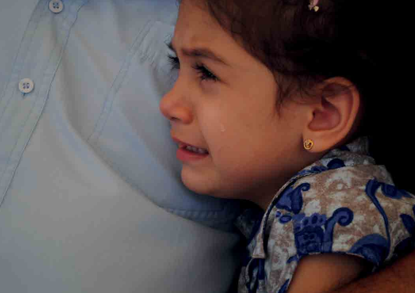
Iraqi refugee child at the Restart centre for rehabilitation of victims of torture and violence taken during a trip to Tripoli.

Mental health and psychosocial problems may affect functioning in a variety of ways – for example, an individual experiencing symptoms of depression such as lethargy, sleeplessness and loneliness may be less likely to take part in community activities, or a mother feeling frustrated, anxious and hopeless may be less likely to be able to perform important care practices for her child. Efforts to promote self-reliance and livelihoods may be undermined if individuals and families are less likely to engage in such activities due to unmet mental health and psychosocial needs. Therefore, it is evident that symptoms of mental health and psychosocial problems can significantly impact individual, family and communal well-being.