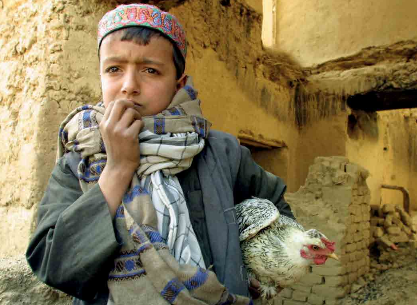
Afghanistan / Returned IDPs / An Afghan IDP returning from the “Russian Compound” in Kabul to land in the Shomali Plain stands in the wreckage of what was once his home. © UNHCR / N. Behring-Chisholm / 3 March 2002