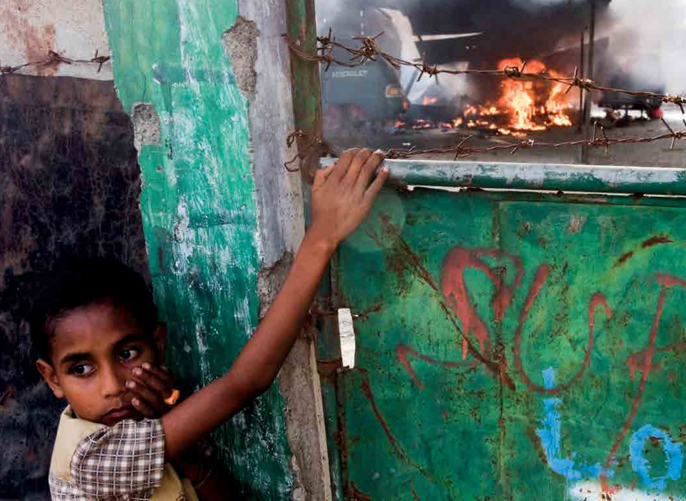
Timor-Leste / IDP emergency / A boy watches as vehicles burn as a result of arson in Dili. © UNHCR / N. Ng / June 2006

UNHCR works in multiple spheres in which MHPSS issues are fundamental. There are a number of areas of UNHCR's work that are directly connected with MHPSS approaches and interventions, and below policy guidelines in the areas of SGBV, child protection, education, and community-based approaches are analysed.