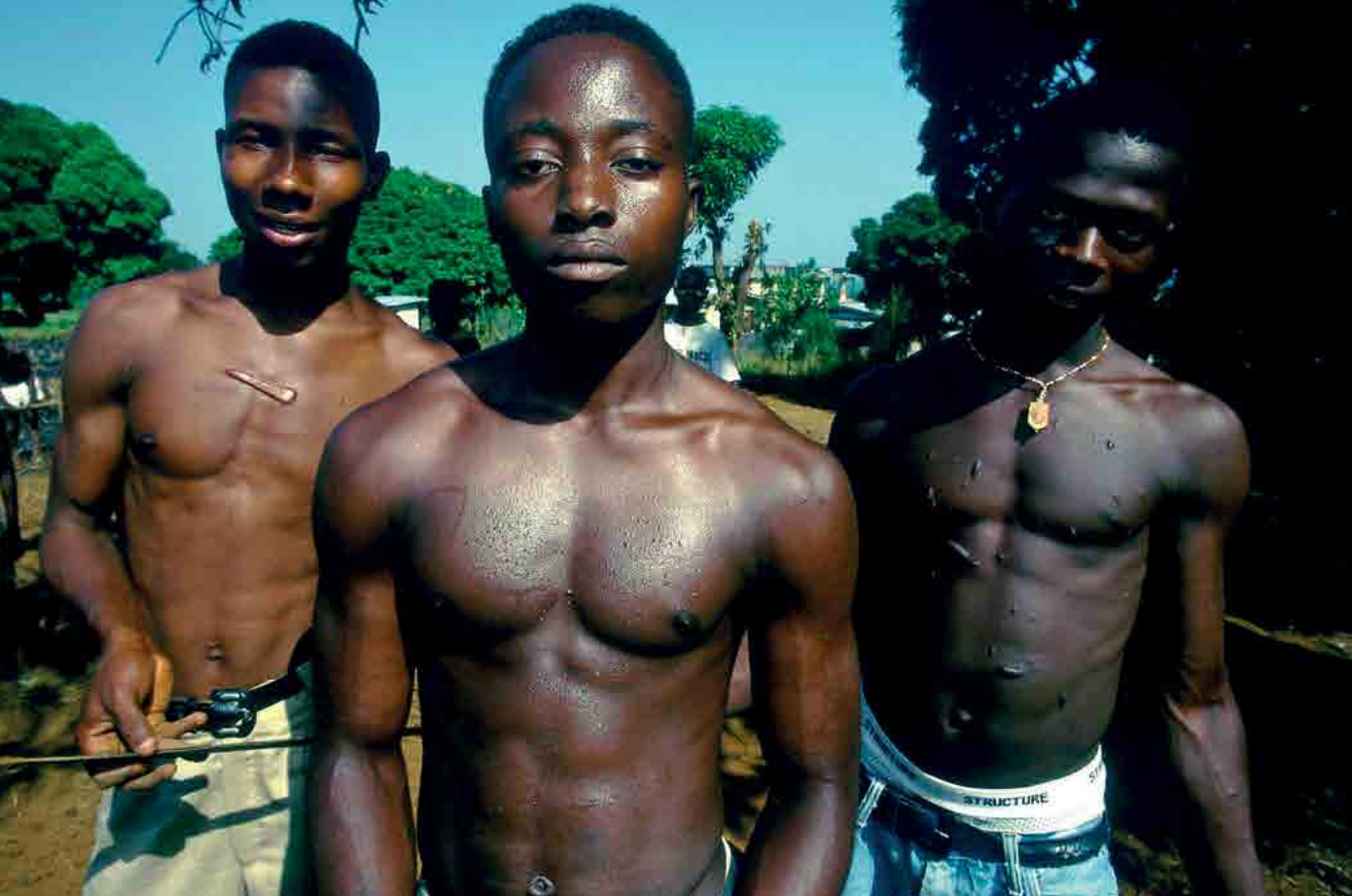
Sierra Leone / IDPS / Former child soldiers in rehabilitation / CAW (Children Affected by War) / Freetown / December 1999

snapshot: Outreach volunteers. As such, recognition of the interconnections between protection and MHPSS, and integration of these activities, can concretely improve services. However, at the moment, the widespread understanding of protection activities and MHPSS as disconnected leads to a “complete split between the work of the protection unit managing violence cases and the work of the psychosocial unit managing psychosocial issues.” 145 The separation of protection and MHPSS approaches and activities is not just an issue of definition or language, but has concrete impacts on quality of services.