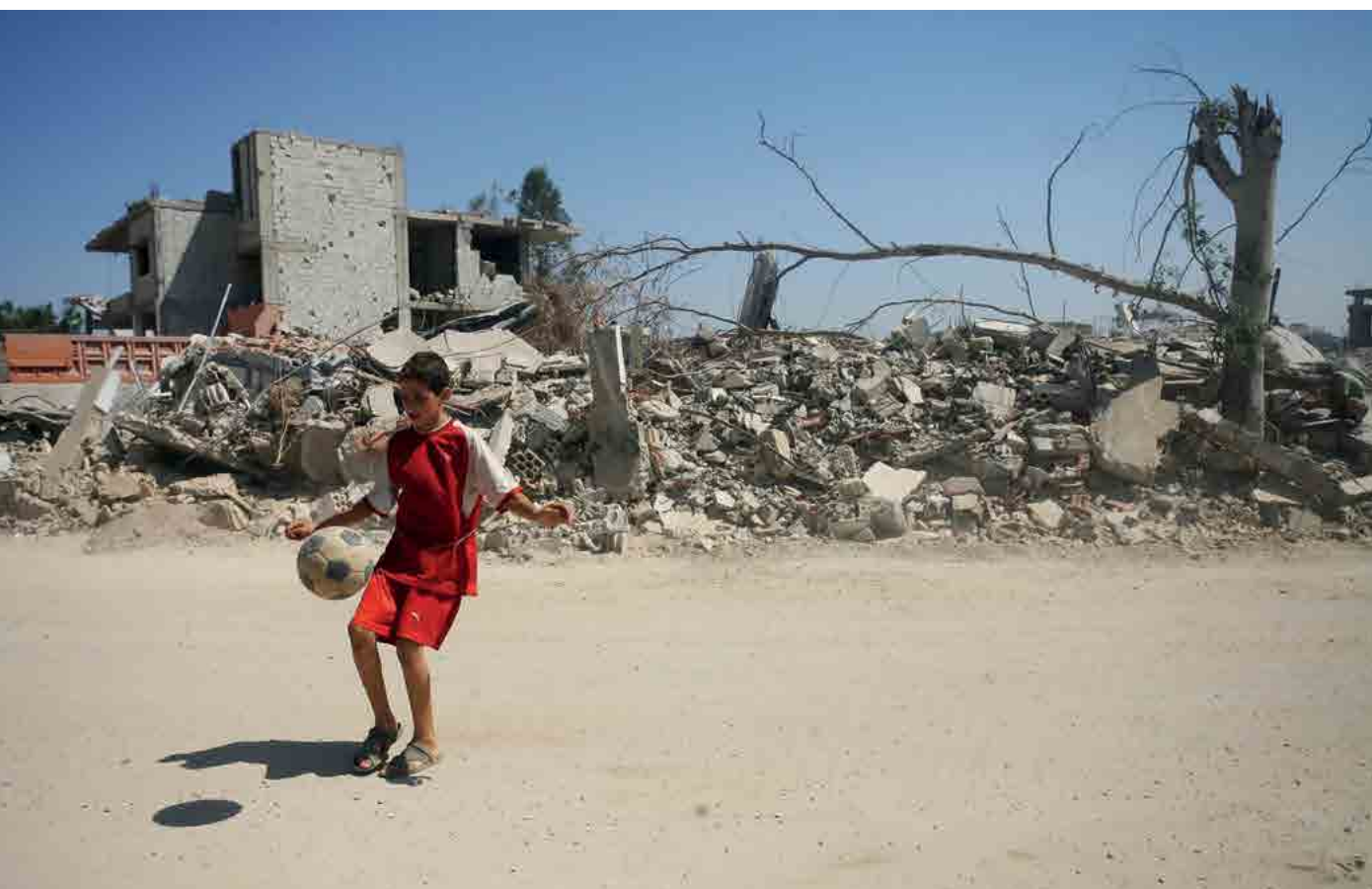
A boy plays football amid the destruction in Sidqine. © UNHCR / A. Branthwaite / August 26, 2006

Having presented definitions of MHPSS and identified the primary influences on the development of a field, this review will turn to the question of where UNHCR fits within this field, mapping its current activities, presenting specific examples from field settings, and analysing relevant UNHCR's policy guidelines and approaches.