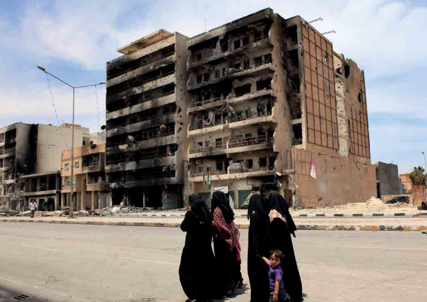
Libya / Misrata / Women and a child from Misrata walk through Tripoli.