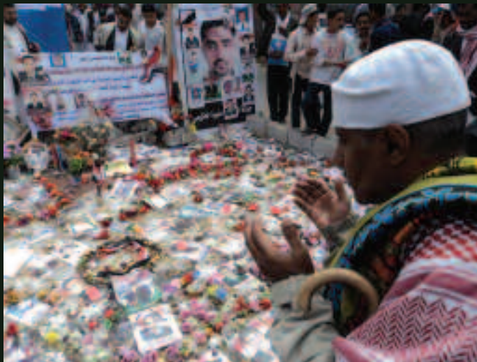
A ceremony honoring those killed in the Friday of Dignity massacre in Sanaa, Yemen, on March 18, 2011, held one week later at the site of the killings. The text on the posters contains a prayer and names of the dead.

Unpunished Massacre details political interference in the investigation as well as testimony from protesters, suspects, and other witnesses implicating government officials in the attack. It calls on Yemeni authorities to carry out a new probe to ensure all those responsible for the massacre are brought to justice, regardless of rank. It warns that absent these measures, the procedures could perpetuate impunity in a post-Saleh Yemen.