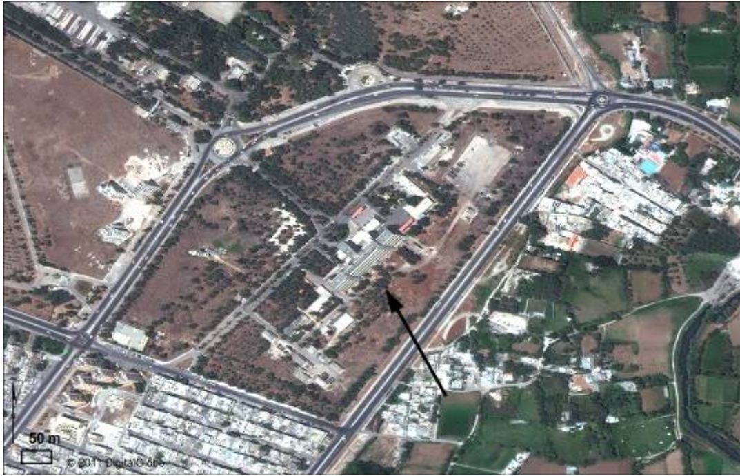
Amnesty International received reports of torture and denial of medical treatment at the military hospital in Homs. (Lat 34.747986 Long 36.690795).

The hospital report gives the cause of death as bruising of the lungs caused by a bullet in the chest.