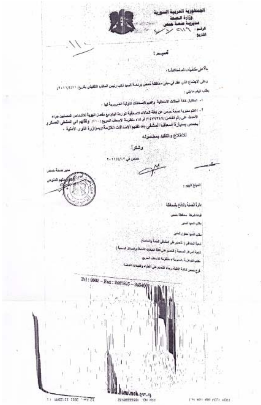
A circular issued by the Health Ministry's Health Directorate in Homs on 12 April calling on hospitals to send wounded patients to the military hospital, where wounded patients are considered detainees and held incommunicado.