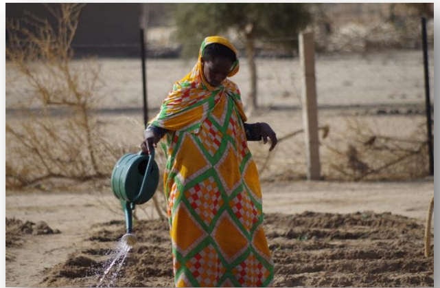
UNHCR supports gardening activities in Mberra camp.