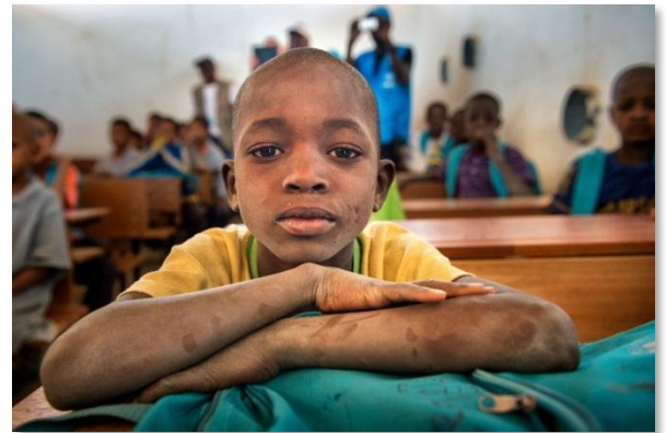
Child at school in Mberra camp UNHCR/A.Dragaj/March 2015