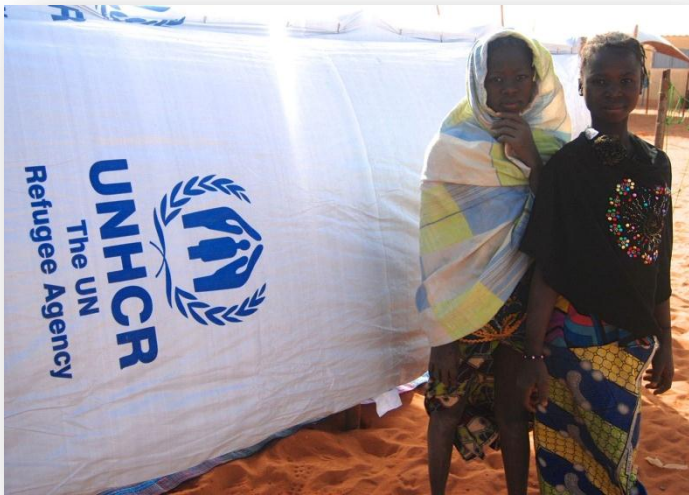
Urgent funding is needed to enable UNHCR to provide protection and assistance to more than 50,000 refugees in Mberra Camp. UNHCR/I.Bocoum/March 2015

Total recorded contributions for the operation amount to some US$ 3.2 million received from the Government of Japan .