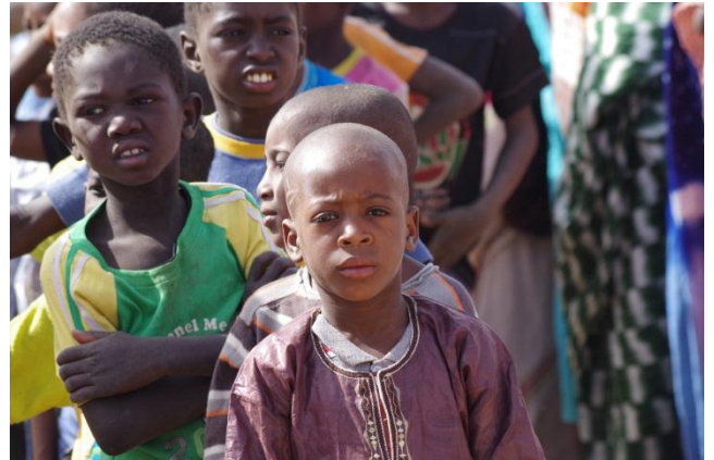
UNHCR supports the six primary schools in Mberra camp. UNHCR/S. Laroze Barrit/January 2015