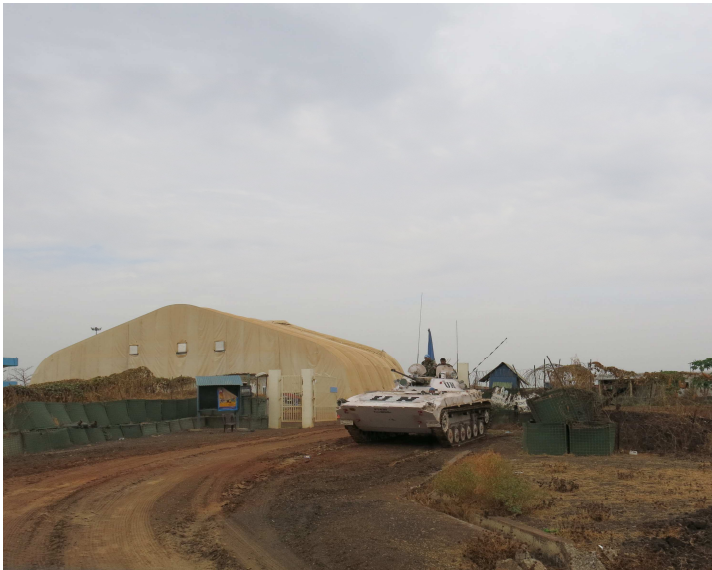
UNMISS armoured vehicle at the base where residents displaced by the conflict are sheltering in Malakal

UNMISS is providing sanctuary for some 80,000, of the 950,000 who are currently internally displaced by the conflict. 74 They are sheltering in the protection sites of eight UNMISS compounds across the country, and many of them are too afraid to venture beyond the gates. In offering sanctuary and providing protection for these individuals, the Mission has undoubtedly saved many lives. Yet it has found itself in an unprecedented situation and in a role for which it was not prepared. The Mission had envisaged perhaps being called upon to provide a temporary safe-haven during intense conflict, after which civilians would return to their homes. But now, several months into the conflict, civilians have not left and more continue to seek refuge in UNMISS protection sites that are not designed to host such large numbers of people over long periods of time. There are, in addition, serious security concerns. Civilians and armed actors seem oblivious to the protections accorded under international humanitarian law to places of sanctuary, to UN peacekeepers, and to peacekeeping bases.