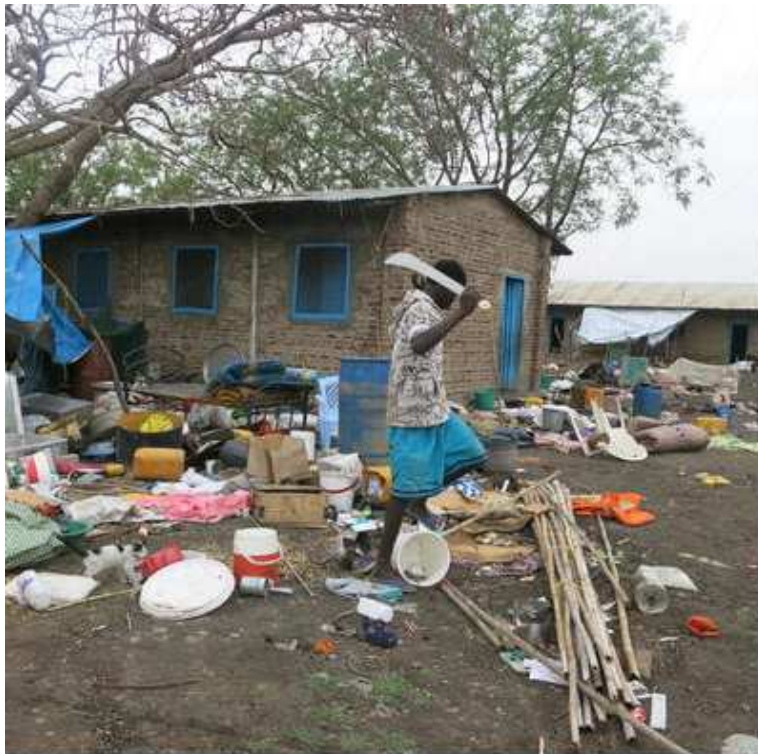
Compound of Christ The King Church in Malakal