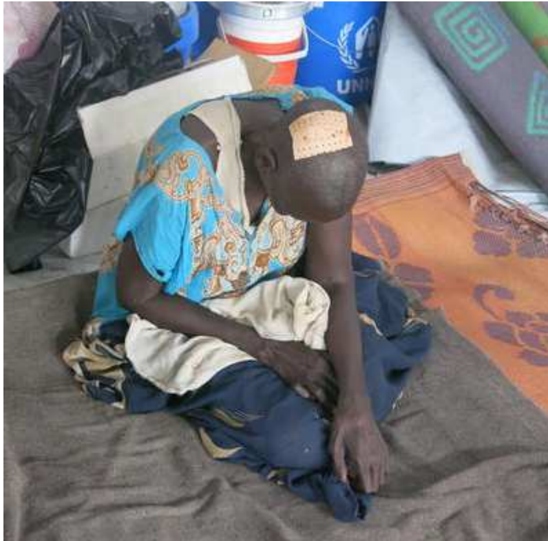
This blind elderly Shilluk woman was beaten by opposition fighters in Malakal hospital in February 2014.