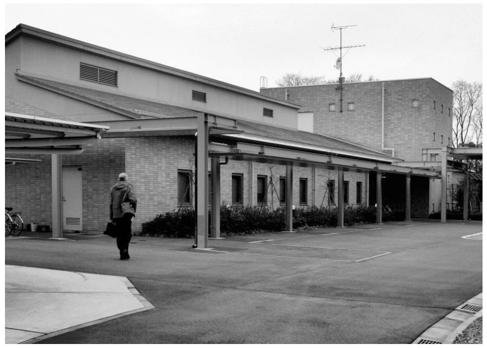
© Al. Tokyo Forensic Unit is one of more than 30 such units throughout the country established to allow for the evaluation of the mental health of detainees. The majority of residents in the Tokyo Forensic Unit are diagnosed with schizophrenia.

The policy also affects families of death row prisoners who are not told of the execution until after it has occurred. In one case, a mother arrived at the prison to visit her son to be told to come back later. When she did, she was told that he had been executed. Again the rationale for this cruel policy is explained in benevolent terms for both family and prisoner: