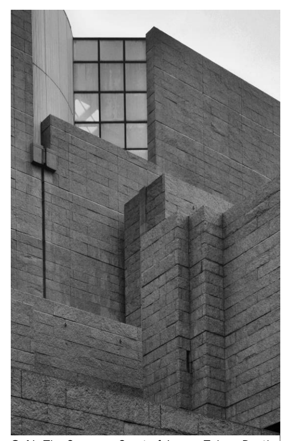
The Supreme Court of Japan, Tokyo. Death sentences are initially imposed by the court of first instance, the District Court, where the case is first heard. On appeal, the case transfers to the High Court and final appeals are heard in the

balance between the crime and the punishment as well as that of general prevention, taking into account ... the nature, motive and mode of the crime, especially the persistence and cruelty of the means of killing, the seriousness of the consequences, especially the number of victims killed, the feelings of the bereaved, social effects, the age and previous convictions of the offender, and the circumstances after commitment of the crime." 44