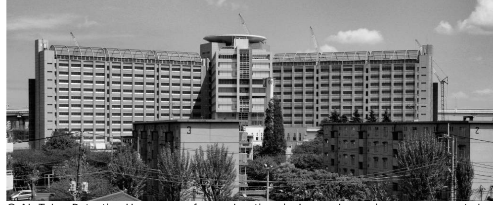
Tokyo Detention House, one of seven locations in Japan where prisoners are executed. Prisoners under sentence of death remain in solitary confinement for many years and even decades in a facility that is essentially designed for pre-trial detention.

This report draws a number of conclusions and makes several recommendations for the government of Japan and to Japanese health professional bodies. The principal recommendations to government and to health professional organizations, set out in full below (pp. 60-63), are: