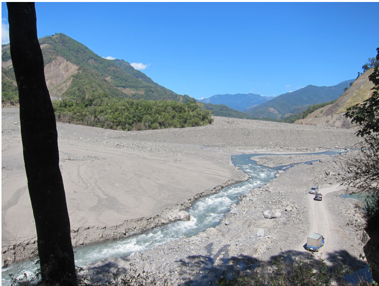
Difficult access to Morakot- affected areas/ Danthong Breen

The Special Statute for Post-Typhoon Morakot Reconstruction, similarly to the IPBL, stipulates that, except in cases of clear and present danger, the government shall not force indigenous communities out from their homeland; reconstruction in disaster-hit areas should be based on respect for local people, their social organizations, culture and life styles. Besides, the government shall designate certain sections within disaster-hit areas that are thought to be unsafe to disallow residence or mandate relocation of residences or villages by a given deadline after having discussed and reached an agreement with existing residents and adequately resettled the