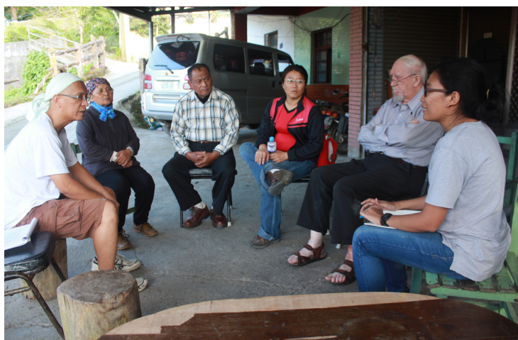
FIDH/TAHR meeting with Bunun community members

In the 1990s, the government began to accept the term 'Aborigine'. In a 1997 constitutional amendment, the term 'mountain compatriots' was eventually abandoned. On the individual level, it was not until 1995 that indigenous people were allowed to use their traditional names in the household registration system. Until then, they were required to use Chinese names. In 1996, a Council of Aboriginal Affairs (renamed Council of Indigenous Peoples in 2002) was established under the Executive Yuan. While fourteen tribes 20 were recognized as indigenous peoples, nine Ping Pu lowland aboriginal tribes have not yet been granted this status despite evidence of their distinct history and culture, language, customs and traditions.