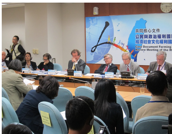
Panel of international experts / Danthong Breen

According to the Judicial Yuan, most judges including 827 women and 1318 judges from district courts have been trained regarding the protection of human rights (154 training hours in total) from 2008 to 2012, including the fifteen Grand Justices. Article 4 of the Act to Implement the Two Covenants stipulates that: “In exercising their authority, governmental institutions and agencies at all levels should conform to the provisions in the two Covenants protecting human rights.” However, until today, judges prefer using existing domestic laws in line with ICCPR/ICESCR rather than referring directly to the Covenants. Meanwhile, some lawyers and legal aid NGOs have already begun to use the two Covenants, or specific General Comments, at every occasion.