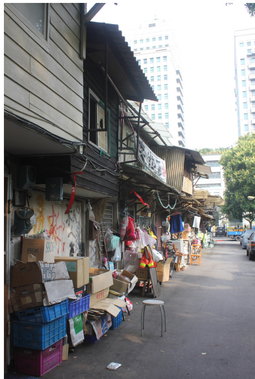
Shaoxing Community in Taipei

Another case concerns Taipei’s Shaoxing Community near Chiang Kai-shek Memorial, where residents have lived with no legal license for decades. In August 2010, they received a letter from National Taiwan University (NTU) that requested the demolition of their houses and the return of campus land, based on a policy called “Enhancing the Efficiency and Usage of State-Owned Real Estates”. Otherwise NTU would file lawsuits against them by claiming so-called ‘Unjust Enrichment’. The community is actually the outcome of two waves of migration, the first in 1949 when low-rank soldiers arriving from mainland China built houses on government land, the second when migrants from rural areas flooded into the capital during the 1960s-1970s. Some NTU students decided to take the side of residents and called on the university to negotiate with local residents rather than immediately ordering them to move elsewhere with a legal notice. University officials responded that they needed government assistance due to a lack of finance and that once authorized by the government, negotiations would immediately be launched with community residents. However, there has so far been no progress in that direction. In spite of recent negotiations, the NTU has still not withdrawn its lawsuits.