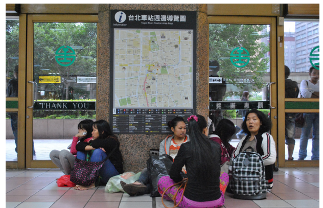
Migrant workers gathering at Taipei Main Station / Puri Kencana Putri

In Indonesia, candidates for labor migration pay a fee of 37 million rupiah [3,000 euros] to the Indonesia Labour Agency. The National Agency on Placement and Protection Migrant Workers provides essential and on-line information before departure. Upon arrival in Taiwan, migrants first go through a health check and in case of a serious illness, have to stay at a migration detention center before being allowed to work in the country. Indonesia's Office for Economy and Trade may help migrants with administrative and legal duties. The office provides a pro bono attorney and interpreter who can accompany them when required. If migrants agree with their employer to extend their contract, they have to communicate with their latest employer and once again go through administrative procedures in Indonesia. The present employer is in charge of extending the contract with the domestic agency.