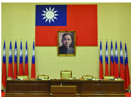
Assembly hall of the Control Yuan / Puri Kencana Putri

A Presidential Office Human Rights Consultative Committee, currently comprising 16 members and including government officials, academics, experts, and NGO representatives, was re-established on 10 December 2010. It added to the existing Executive Yuan's human rights task force and the Control Yuan's Human Rights Protection Committee. The presidential committee has the following functions, according to directives set out when it was established: promoting and advising on human rights policy; producing national human rights reports; doing research on international human rights systems and legislation; advising the president on other human rights matters. The fact that the committee members are all unofficial staff, without an independent budget and manpower, makes, until today, the above-mentioned tasks difficult to achieve in practice.