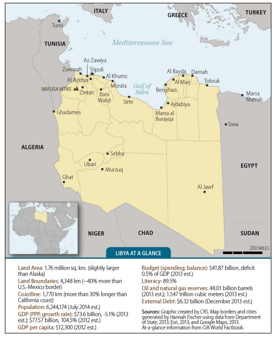
Figure 2. Libya: Map and Select Country Data

Until military chain-of-command issues are resolved, the new Council of Representatives is elected, new executive leaders are identified, and a new constitution is developed, endorsed, and implemented, the Libyan government may lack the political legitimacy, will, and capabilities necessary to take assertive action on difficult security and economic issues.