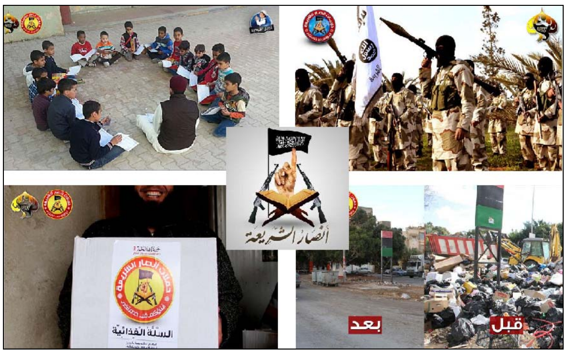
Figure 3. Recent Ansar al Sharia Imagery from Libya and Syria

Libyan media and Ansar al Sharia social media accounts suggest that the organization's current operations extend to Benghazi, Sirte, and areas of eastern Libya and include military training, security patrols, outreach and education efforts, and public works projects. The group also has publicized its efforts to deliver relief supplies to civilians in northern Syria and other countries. The U.S. government has not released a detailed unclassified assessment of the size and capabilities of Ansar al Sharia in Libya. Publicly available information suggests the group's membership may be in the high hundreds or low thousands of individuals, some of whom possess truck-mounted anti-aircraft guns, rocket-propelled grenades, military-style uniforms, and assault rifles.