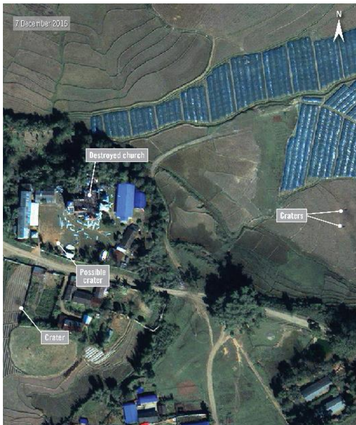
← © Imagery from 7 December 2016 shows a destroyed church in Monekoe, Myanmar. Multiple craters are visible in fields near the church. One possible crater is visible within the church compound. Coordinates: 24.1013°, 98.3206° Image © 2017 DigitalGlobe, Inc.