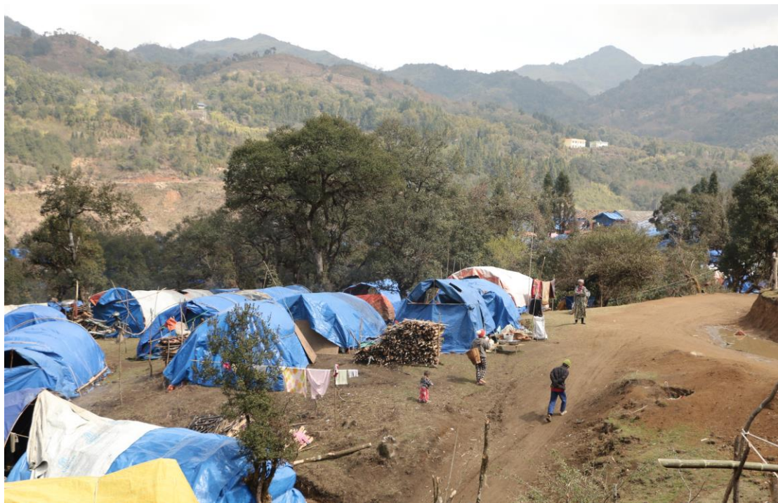
↑ Sha It Yang IDP camp, which houses more than 2,000 people displaced by the conflict.

Humanitarian officials explained that access restrictions cause four specific problems for responding quickly to displaced peoples’ needs related to shelter, water, and sanitation. First, the restrictions make it harder for any organization to bring certain materials, like timber or bamboo, to NGCA. Second, since international organizations are denied access, the burden falls entirely on a few local organizations; given the demands, they are overstretched. Third, while international organizations can fund and help instruct local organizations on tasks like building water pumps or latrines, they are not able to inspect for quality assurance, as they normally would. 187 This lack of presence also affects protection monitoring. “It is hard for us to assess the situation, protection by presence is important,” said an international aid worker. “It needs to be official.” 188