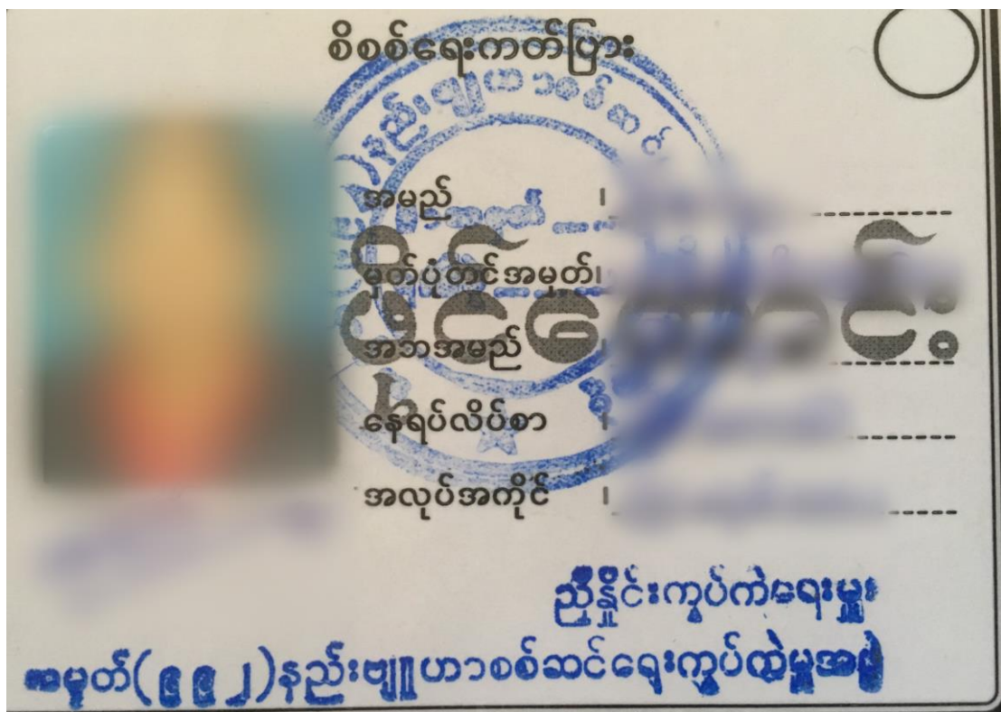
☹ ↑ A special identification card issued by Myanmar authorities in early 2017 to residents of villages between Pang Hseng and Monekoe towns. Anyone caught outside a camp or home without the identification card faced arrest and detention by the Myanmar security forces.

A Myanmar expert said that the ordered or de facto clearance of villages, and the pressure on local communities more generally, represented a continuation of abusive counterinsurgency tactics that the Myanmar Army has deployed for decades. 173 The impact these tactics have in terms of depriving people of their livelihoods are compounded by the restrictions on humanitarian access, discussed in detail below, and have dangerous medium- and long-term implications on people’s standard of living, including access to adequate food and their physical and mental health. 174