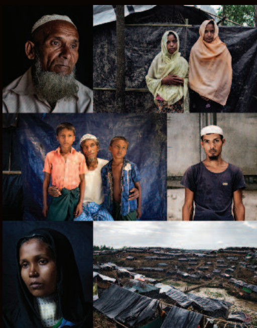
Survivors of the Tula Toli massacre in Rakhine State, Burma.

Human Rights Watch calls on the Burmese government to immediately cease its campaign of ethnic cleansing and urgently provide unimpeded access to Rakhine State for humanitarian aid groups and human rights monitors. The United Nations Security Council and foreign governments should impose targeted sanctions on Burmese military officials, and demand that Burma allow the UN-created Fact-Finding Mission to visit the country.