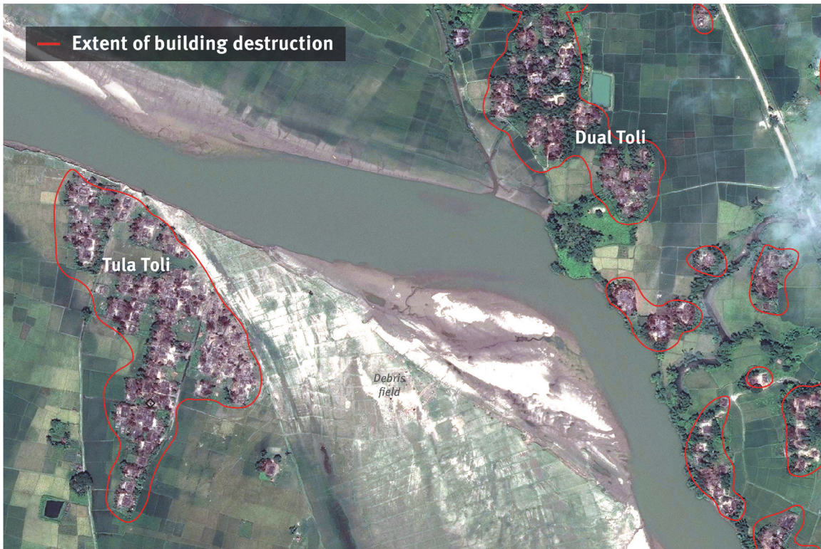
Satellite imagery