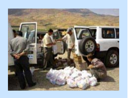
Preparing assistance for returnees