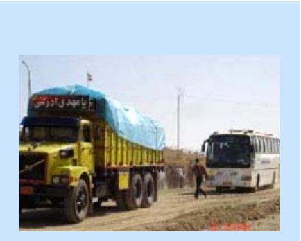
The journey to Iraq – UNHCR

Activities in various UNHCR-supported returnee reintegration projects progressed rapidly. By the end of the month, from a total 334 housing units to be constructed in the south of the country, 159 were completed and construction of a further 125 units was ongoing. Out of 41 quickimpact projects funded by UNHCR, 27 projects were completed. These villagelevel projects include activities such as refurbishing schools, providing equipment health centres, cleaning connecting remote villages to existing water networks, and developing incomegeneration projects for women. In northern Iraq, the site preparation, excavation, laying of concrete foundations and building of walls to the level of the roof was completed for 182 housing units.