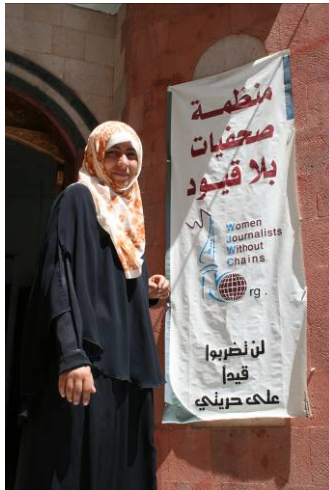
Tawakkol Karman

Three days earlier Amnesty International delegates experienced first-hand the authorities' hostility towards coverage of protests in defence of free speech. As they watched a peaceful demonstration in Sana'a organized by Women Journalists Without Chains, police threatened to arrest and bring charges against an Amnesty International delegate who was carrying a camera if any attempt were made to photograph the peaceful march, and said it was illegal for the delegates even to be present although the women journalists were holding their protest peacefully and in a public place. The Amnesty International delegates also witnessed the arrest of a protester who was carrying a camera, though he was released when other protesters complained about this, though the police kept his camera. Meanwhile, men in plain clothes who appeared to be security personnel filmed and photographed people involved in the demonstration.