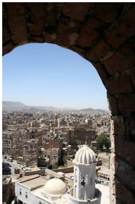
Old Sana'a skyline

Those speaking out against government policies or human rights violations have also been targeted, among them journalists, human rights defenders and lawyers. Legislation and specialized courts created in the name of