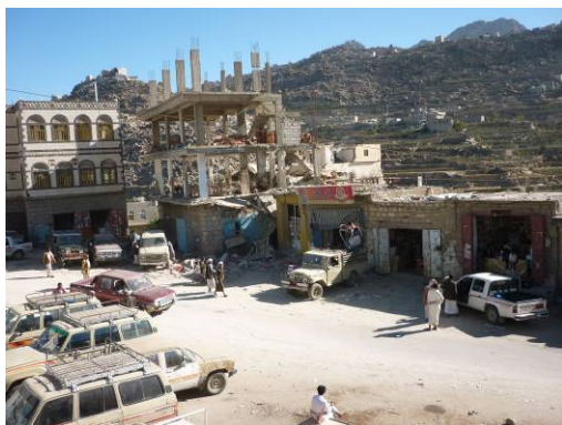
A bombed market place, Sa'dah, Yemen, March 2010

Among other unpublished terms of the ceasefire agreement are said to be the release of those held by the Yemeni authorities in connection with the conflict, including prisoners who have been tried and sentenced as well as those who were held awaiting trial; and the formation of a national implementation committee comprising members of Yemen's political parties. When this committee was set up, it was composed of 27 members of the House of Representatives and the Shura (consultative) council and representatives of an umbrella group of opposition political