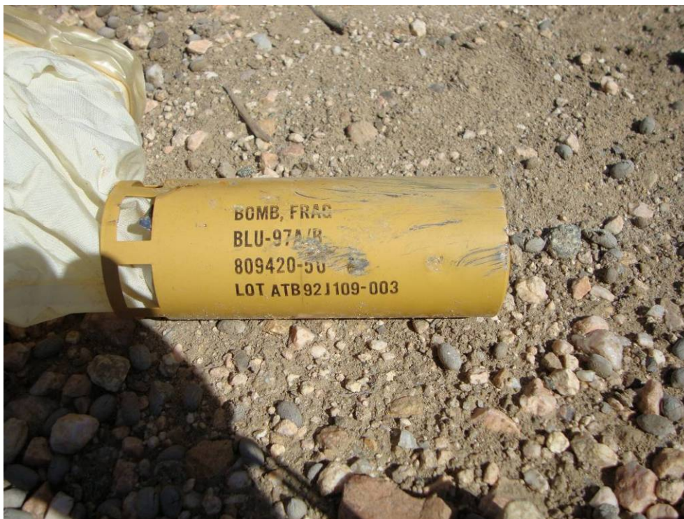
Part of a cruise missile carrying cluster munitions, Yemen

At dawn on 17 December 2009, missiles were fired at two settlements in al-Ma'jalah area in al-Mahfad district of Abyan. By the time the attack was over, at least 41 people lay dead, 21 of them children and 14 of them women. The Yemeni authorities announced that the attack had targeted a "terrorist training camp". They acknowledged that some women and children might have been killed, but denied any responsibility, claiming that al-Qa'ida had brought families into the camp and so were exclusively to blame for any deaths of women and children that had occurred as a result of the attack.