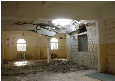
Inside a building that took a direct hit, Sa'dah, Yemen, March 2010

The witness, a man from al-Nadir, said he had fled his home between 20 and 25 December 2009 with 30 members of his family because they “had just had 10 days without sleep because of the Saudi planes constantly circling above the town” and “had seen more and more dead bodies.” He said an attack by Saudi Arabian forces in November on three family homes left 36 people dead: “So many were killed from one family that they had to create a cemetery for themselves.”