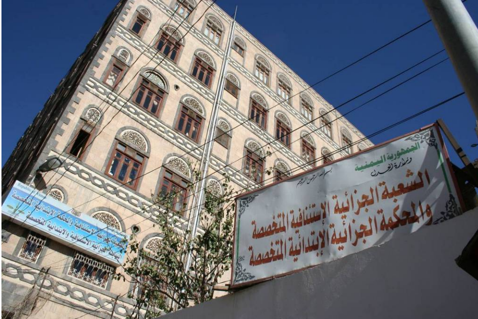
Specialized Criminal Court in Sana'a

Many detained security suspects and critics of the state are held without charge or trial but others have been prosecuted before the courts, notably the Specialized Criminal Court, where trials are generally reported to fall short of international standards of fair trial. In practice, abuses of defendants' rights to fair trial begin before the case even reaches court with security suspects and those targeted because of their criticism of the government being frequently subjected to arbitrary arrest, enforced disappearance and incommunicado detention during which they are denied access to lawyers and liable to torture and other ill-treatment, often to extract "confessions" that can then be used as evidence for their prosecution.