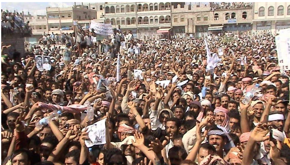
Mass demonstration, south Yemen, 2008

In 2009, Yemeni security forces killed at least 46 people in or near demonstrations, including funeral march processions for activists killed in previous demonstrations, and injured at least 164. In the first six months of 2010, at least 20 more people have been killed and 87 injured. Members of the security forces have also been killed during protests at least 15 have been killed since the beginning of 2009, according to media reports.