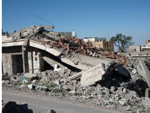
A destroyed house, Sa'dah, Yemen, March 2010. The graffiti reads “This is the help Yemen gets from America”

“I was in the market. I saw two planes with parachutes coming down [from them]. People said and thought it was aid. They took about three minutes to come down. I cried ‘bombs!’ and ran away yelling