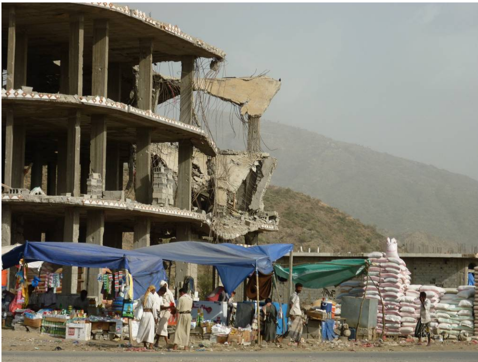
A makeshift market by the remains of shops and homes, Sa'dah, Yemen, March 2010