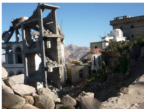
Building destroyed by aerial bombardment, Sa'dah, Yemen, March 2010

Yemeni government restrictions on access to the region combined with the prevalence of land mines and other security concerns arising from the presence of Huthi fighters and Yemeni security forces meant that virtually no independent observers or media visited Sa'dah during the sixth round of fighting or in the weeks that followed the truce. However, evidence of the scale of death and destruction began to emerge as people who fled their homes began arriving in safer areas, including the capital. A member of one of four post-ceasefire local committees who had visited the region, described the devastation, stating that three-quarters of the old city of Sa'dah had been completely destroyed.