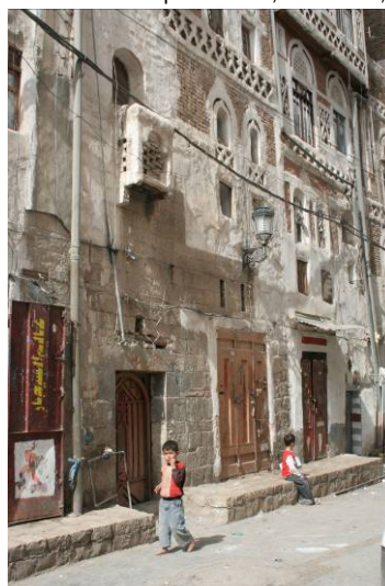
Children in old Sana'a

Yemen also faces a dire economic situation. 2 Around a third of its 24 million people suffer chronic hunger 3 and nearly half live on less than US$2 a day. 4 Some 43 per cent of children aged under five are undernourished, 5 reflected by the ubiquitous street children begging or selling their cheap wares, and young people suffer extremely high levels of unemployment. Millions of Yemenis are still suffering the consequences of their government voting against the UN Security Council's resolution to use force after the 1990 invasion of Kuwait by Iraq, 6 which led to most international aid being cut and hundreds of thousands of Yemeni workers being expelled from Gulf states, primarily Saudi Arabia. All these factors have left Yemen ranked 140 out of the 182 countries listed on the human development index, a comparative measure of life expectancy, education and standard of living. 7 With the country's few natural resources, including oil and water, fast running out, prospects for growth and future development look bleak.