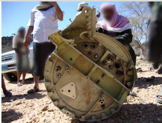
Part of a cruise missile carrying cluster munitions, Yemen

Amnesty International obtained photographs, apparently taken following the attack, which suggest that the attack used a US-manufactured cruise missile that carried cluster munitions. The photographs enable the positive identification of damaged missile parts, which appear to be from sections of a BGM-109D Tomahawk land-attack cruise missile. This type of missile, launched from a warship or submarine, is designed to carry 166 cluster sub-munitions (bomblets) which each explode into over 200 sharp steel fragments that can cause injuries up to 150m away. Incendiary material inside the bomblet also spreads fragments of burning zirconium designed to set fire to nearby flammable objects.