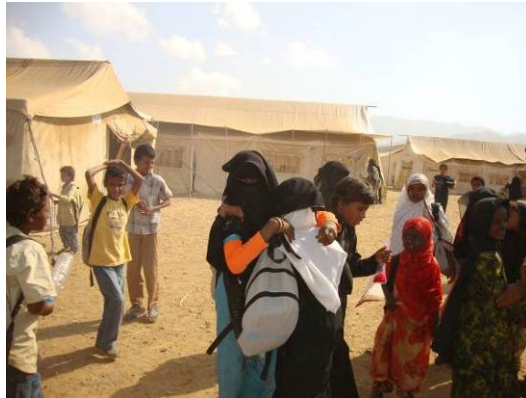
Al-Mazraq camp for IDPs in Harad district, Hajjah governorate, Yemen, January 2010

By March 2010, according to UNHCR, around 280,000 Yemenis from the north were displaced, many of them for the second or third time. Humanitarian organizations told Amnesty International that of those displaced, only 10 per cent of them were in the camps; the rest had found shelter with friends and relatives, or in derelict buildings, rented accommodation, the grounds of mosques, and open spaces. Local activists told Amnesty International that they were struggling to provide assistance to the displaced from Sa’dah because of lack of resources, and that