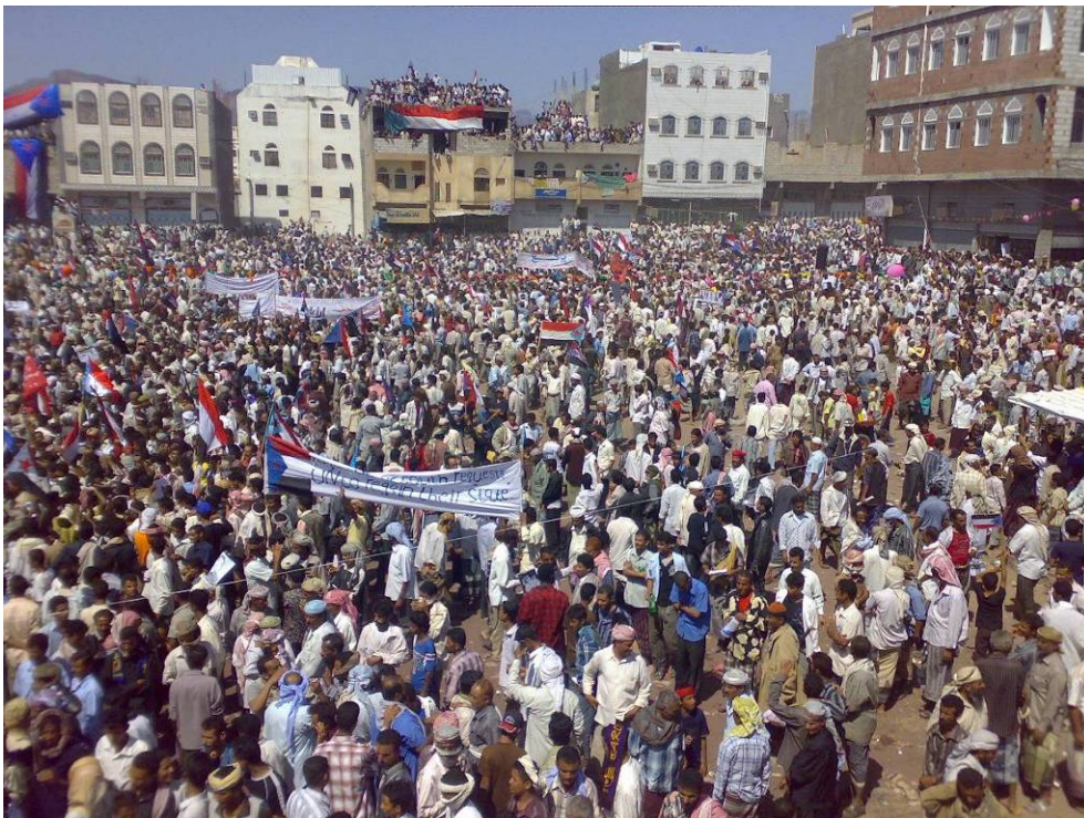
Southern Movement mass demonstration, 2009

A soldier forcibly demobilized from the army in 1994