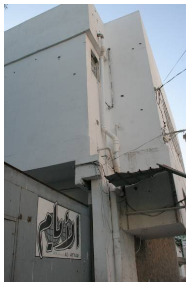
al-Ayyam building damaged by bullets

The independent media came under sustained attack after newspaper coverage of protests that took place in the south in the run-up to 27 April 2009, the 15th anniversary of the start of the civil war of 1994. On 30 April the authorities confiscated every copy of al-Ayyam , Aden-based and one of Yemen’s largest-circulation daily newspapers, from news stands and distribution points in Sana’a and southern cities. In early May they took similar action against several other newspapers, and security forces physically blockaded the offices of al-Ayyam to forcibly prevent distribution of the paper. The government also announced a suspension of all newspapers that it considered were harming the unity