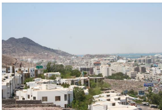
Aden