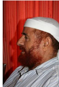
Abdullah al-Bakri

Some detainees say that they have been tortured or otherwise ill-treated in detention. Tens of